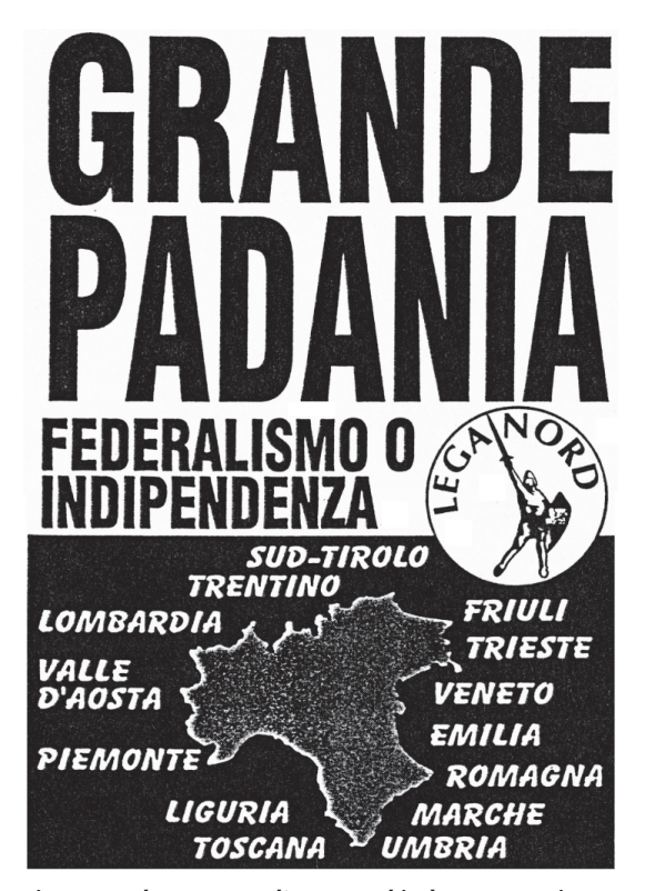
Figure 1 The Lega Nord's geographical representation of the boundaries of 'Padania', taken from the party's 1996 National election campaign

the Lega Nord maybe the first authentic post-modernist territorial political movement in its self-conscious manipulation of territorial imagery to create a sense of cultural/economic difference with an existing state of which it is part. (Agnew and Brusa 1999, 123)