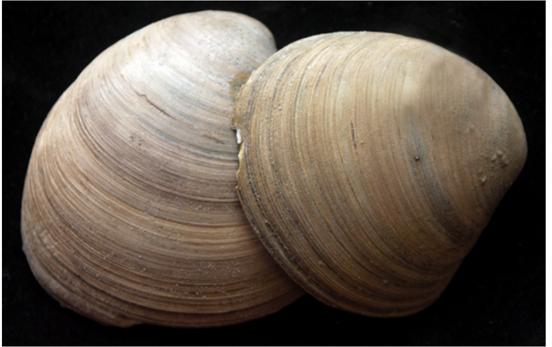
Fig. 1. Shells of the Eocene bivalve genus Polypecora from southern England, preserved with colour banding intact. (Image: P. Doyle).