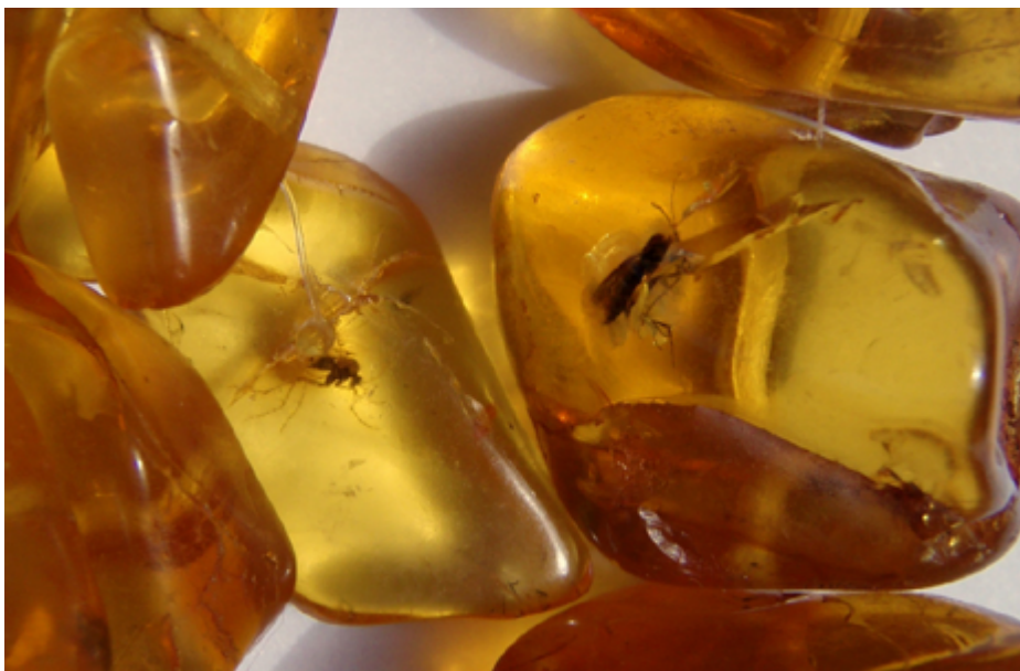
Fig. 4. Insects preserved in Baltic amber,