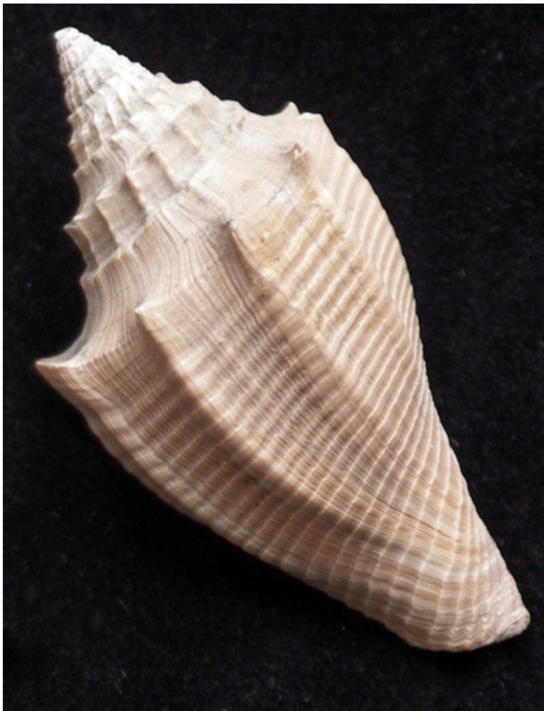
Fig. 2. The gastropod Athleta athleta from the Eocene clays of southern England.