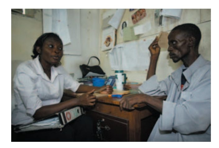
Plate 9.5 Altruistic motives have been found to be the best predictors of length of service in AIDS organizations.