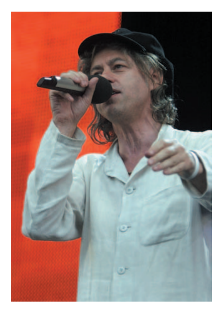
Plate 9.4 Bob Geldof's organization of emergency aid for the starving people of Africa is a public example of prosocial behaviour.