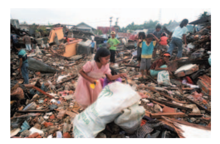
Plate 9.1 The Indian Ocean tsunami of late December 2004 evoked an unprecedented willingness to help all over the world.