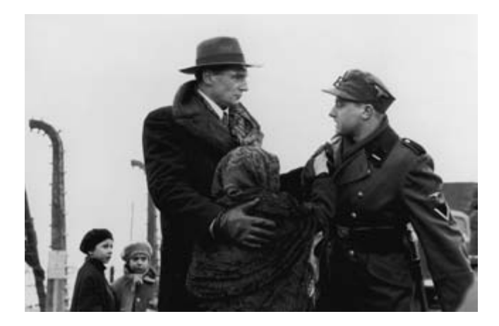
Plate 9.3 Oskar Schindler (shown here in the film) took great personal risks and invested both time and money to help Jews escape from the Nazis.