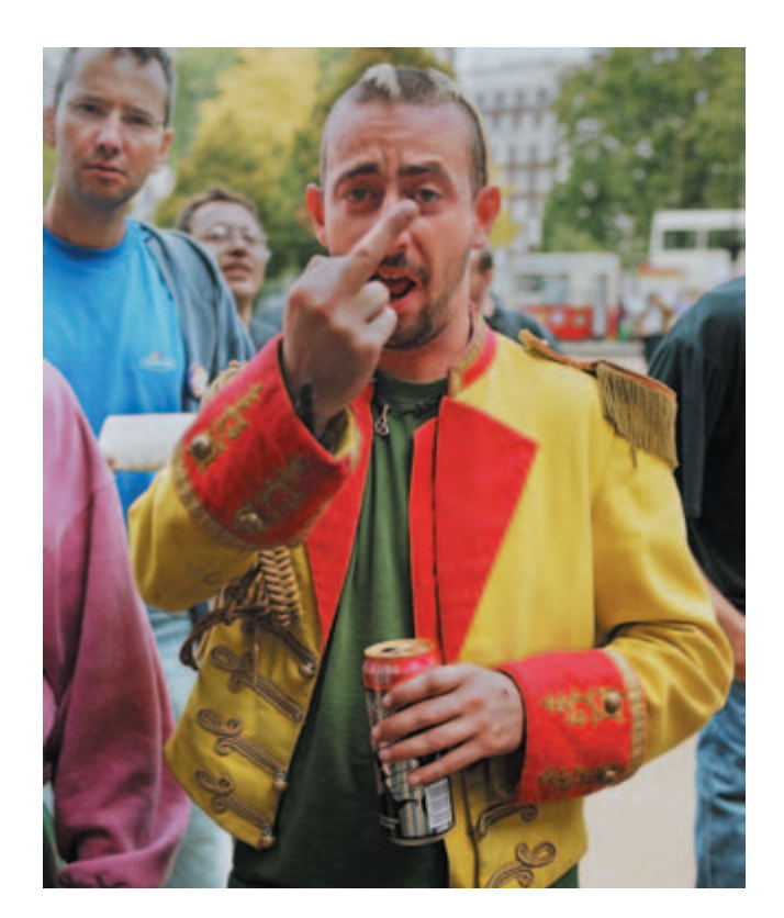
Plate 8.6 Even moderate amounts of alcohol lead to increased aggressive behaviour.