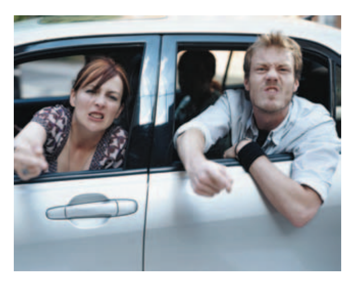
Plate 8.5 Are women really less aggressive than men?