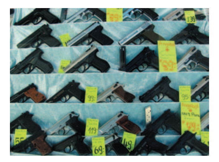
Plate 8.2 Do guns make us more likely to behave aggressively?