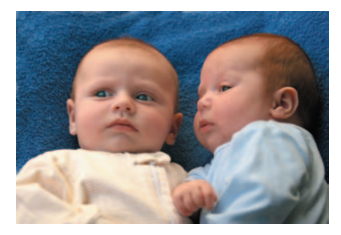
Plate 8.1 Our genes partly determine how aggressive we are, but so too does the social environment.