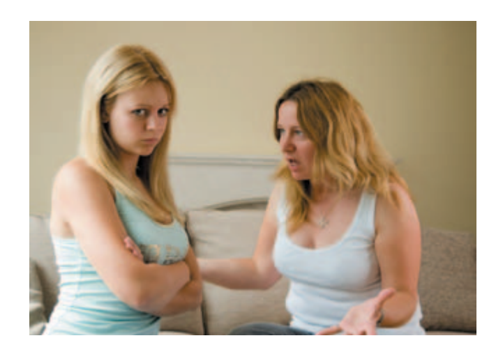
Plate 8.4 Mothers' and children's levels of aggression are significantly correlated only for girls.