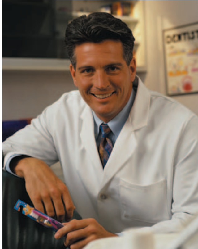
Plate 7.4 In this advertisement endorsement by an expert is used as an advertising strategy.