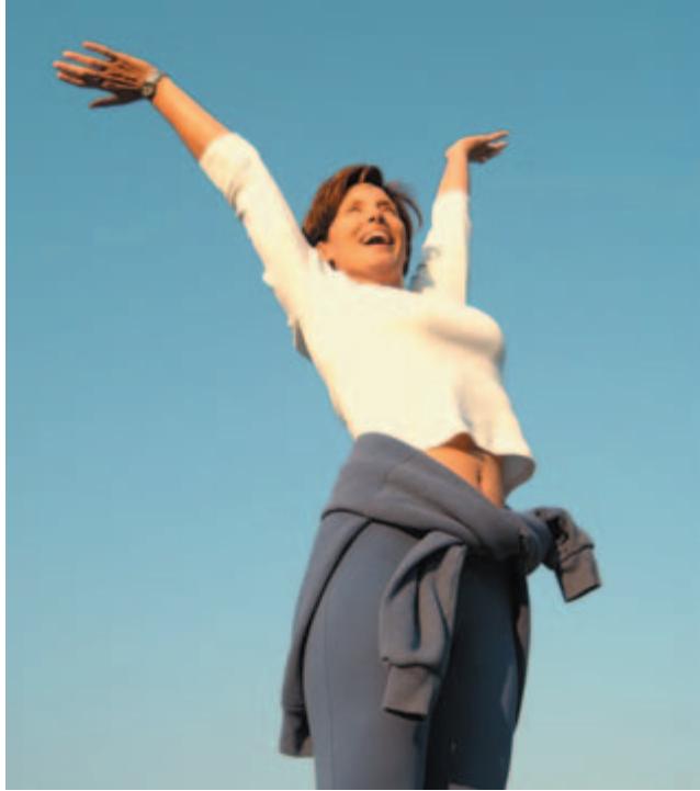
Plate 7.2 How does the weather affect your life satisfaction?