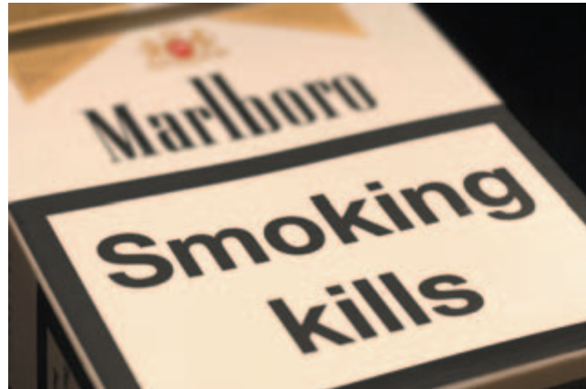
Plate 7.1 Thanks to effective anti-tobacco campaigns, smoking is now generally recognized as a health risk and an addiction.