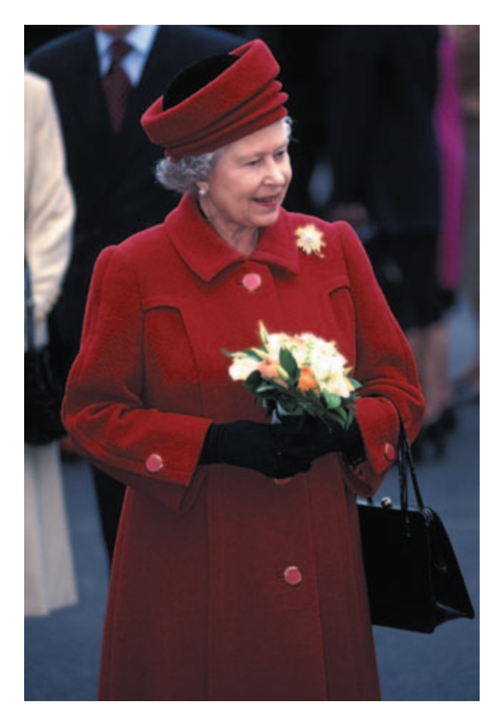
Plate 6.6 How accessible is your attitude towards Queen Elizabeth II?