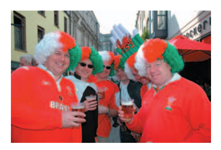
Plate 6.3 Attitudes towards, e.g., the Welsh rugby team may be developed from friends supporting the same team.