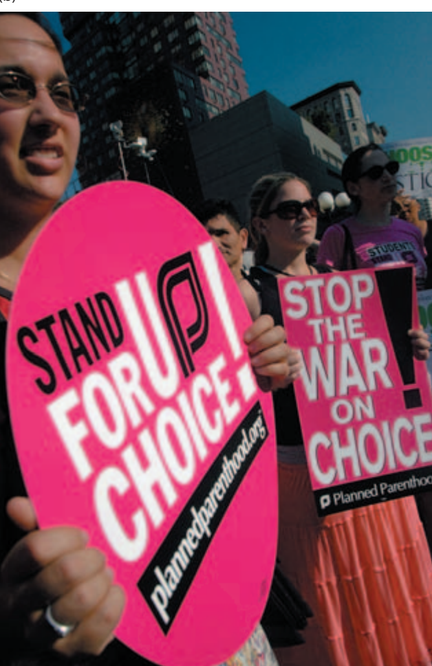
Plates 6.4a and b Attitudes toward abortion might be based on freedom of choice and sanctity of human life.