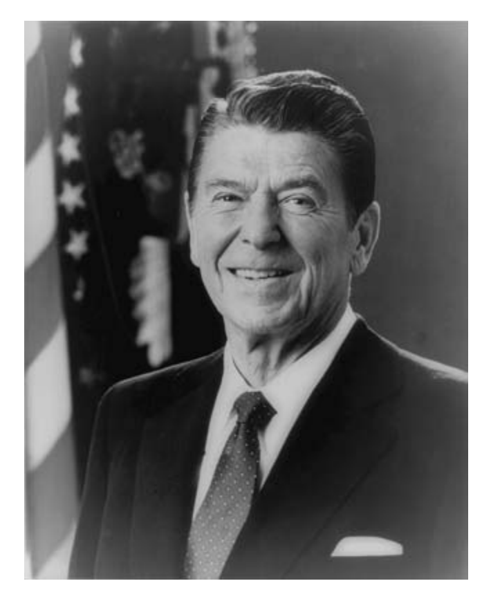
Plate 6.7 Do attitudes towards politicians predict voting behaviour?