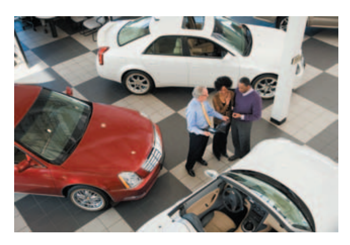
Plate 6.2 Attitudes toward different cars might be based on the positive and negative characteristics of each car.