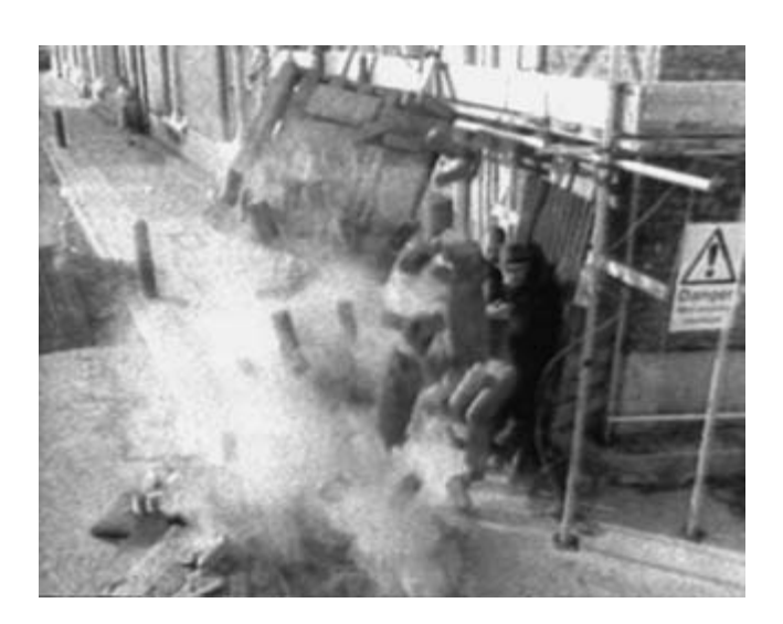
Plate 4.2c Final still of the skinhead in the Guardian campaign.