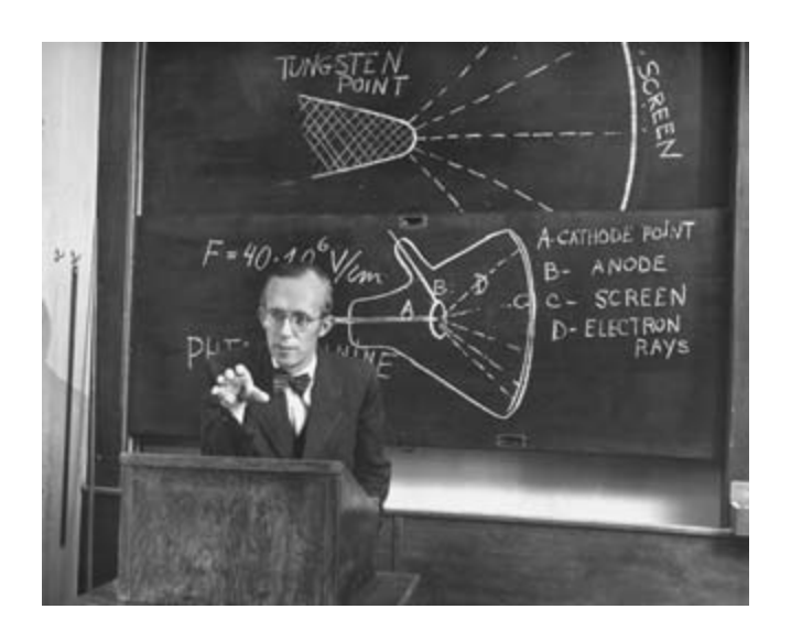
Plate 4.5 Could being primed with a photo of a 'professor' make you perform better at a quiz?