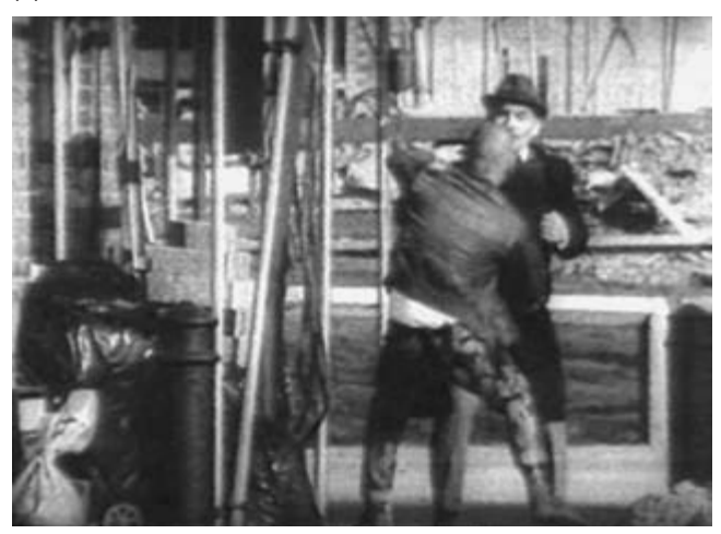
Plates 4.2a and b Two stills of a skinhead in the Guardian advertising campaign.