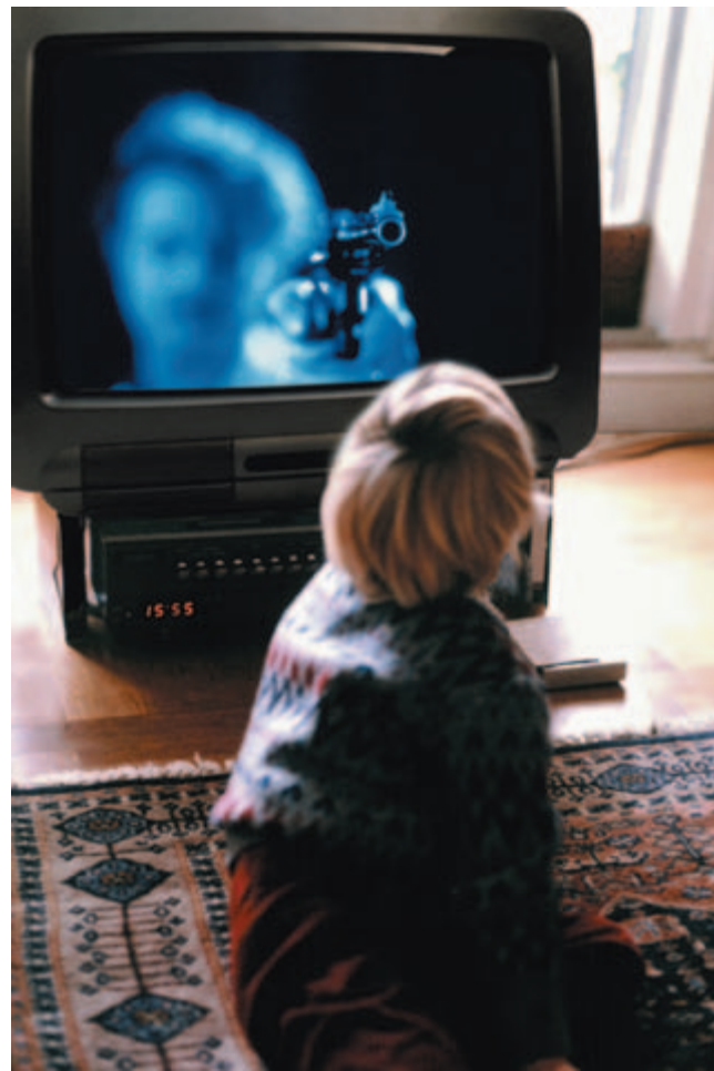
Plate 2.3 What research method might be used to study the impact of viewing violent television on subsequent behaviour?