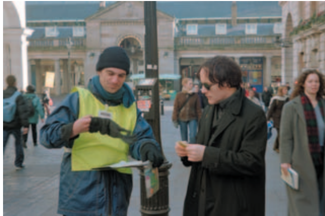
Plate 2.1 One strategy for gathering research evidence is to survey public opinion by interview.