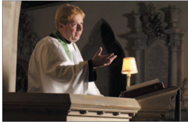
Plate 2.2 Would you be more likely to help someone in need after hearing a sermon on the parable of the Good Samaritan?