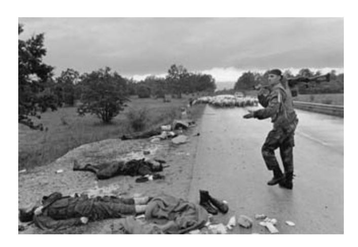
Plate 14.6 Why did previous contact not prevent conflict in former Yugoslavia?