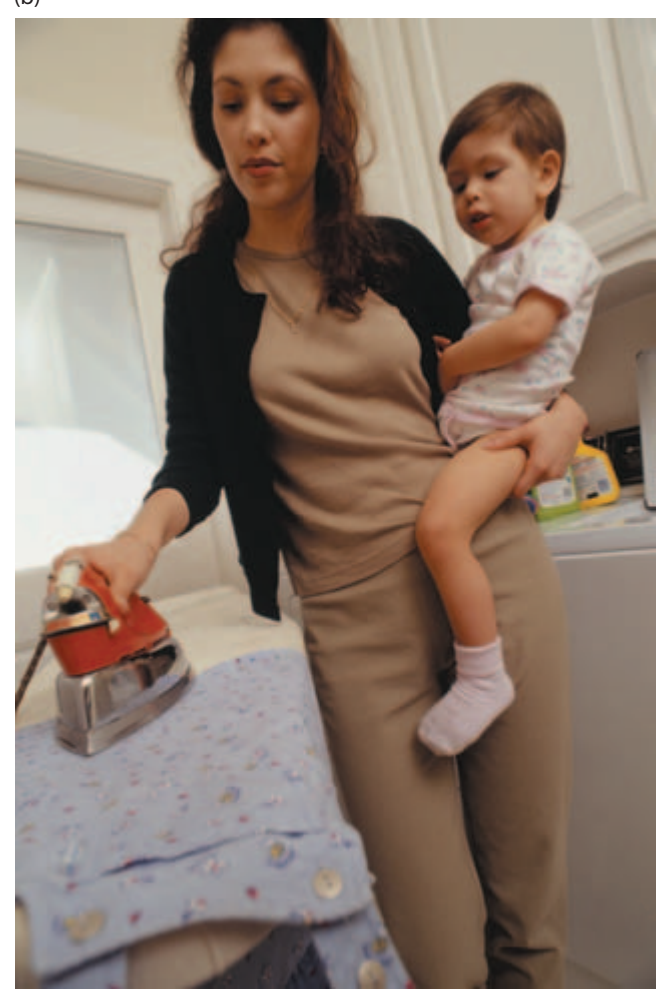
Plates 14.3a, b and c Different groups in society evoke different emotions.