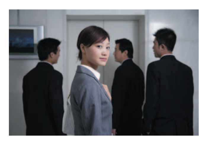
Plate 14.1 Hiring a woman can be a way for an employer to use a 'token minority' to demonstrate that he does not discriminate.