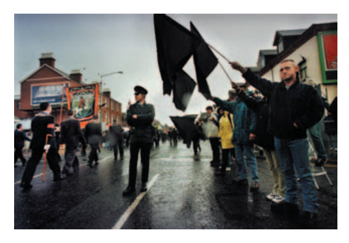
Plate 14.5 Cross-cutting categorizations that are of equal importance to the pre-existing categorizations (e.g. religion in Northern Ireland) are difficult to find outside the laboratory.