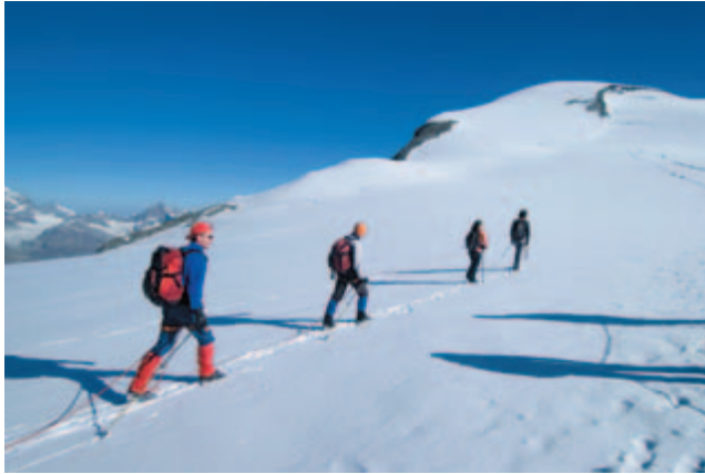
Plate 13.2 This group is only as fast as its slowest member.