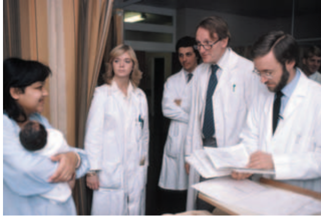
Plate 13.5 How does the designated leader in a group such as this manage the processing of distributed information during group decision-making?