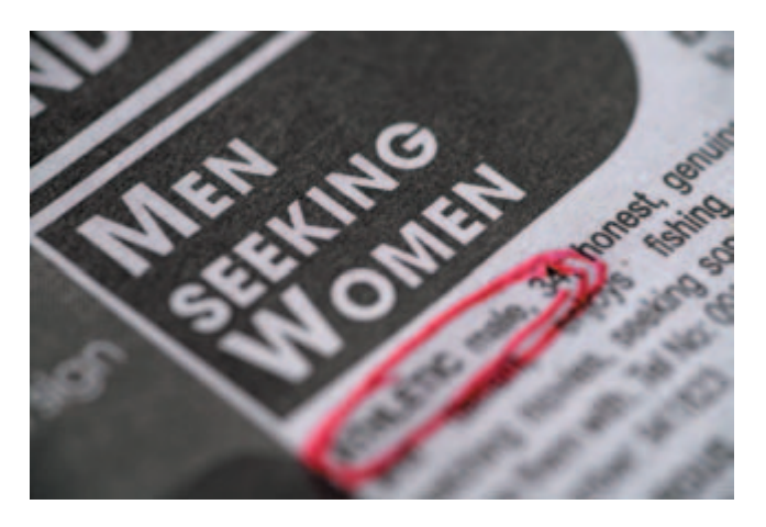
Plate 10.6 Personal advertisements in newspapers are one way to find a partner.