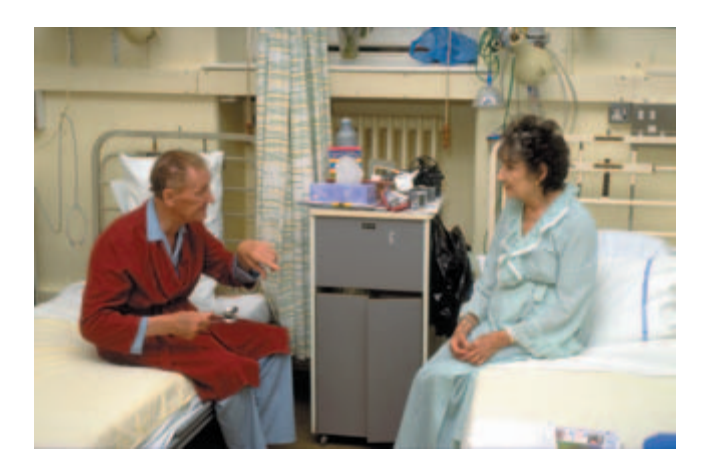
Plate 10.1 Social comparison with others may provide individuals with valuable information, for example about how to deal with their own illness.