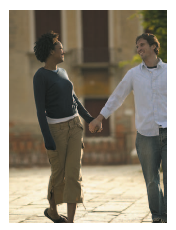
Plate 10.4 According to the triangular theory of love, passion (or sexual attraction) is one of the defining characteristics that distinguishes romantic love from platonic love or liking.