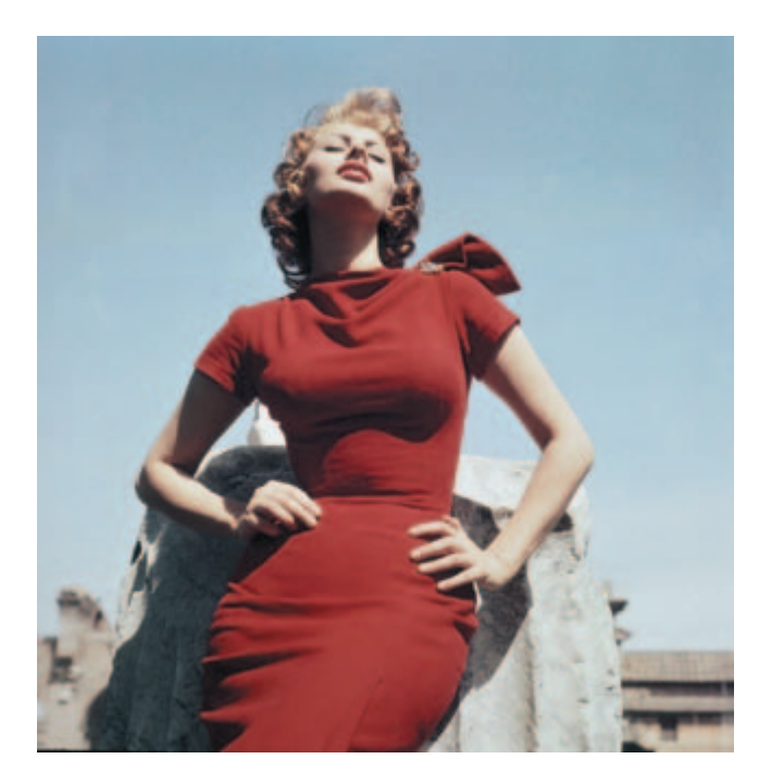
Plate 10.5 Males in different cultures are attracted by women who have an 'hourglass figure'.