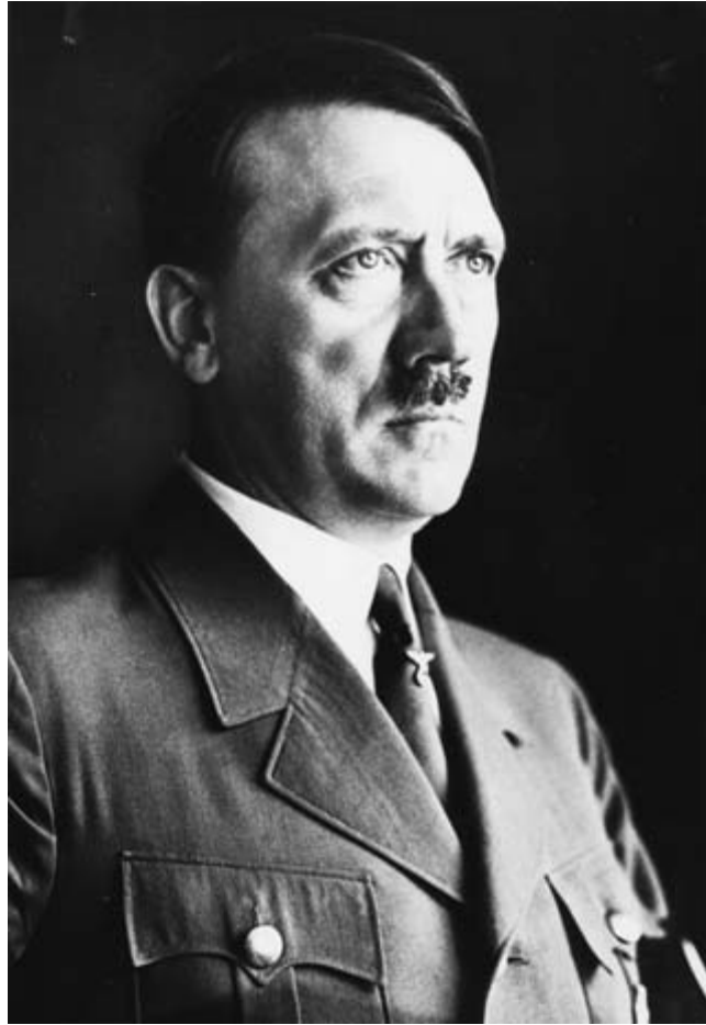
Plate 1.4 How did Hitler's actions affect the development of social psychology?