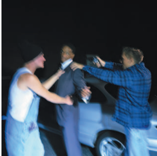
Plate 1.2 How is the way social psychologists study aggression and violence different from the approach of sociologists?