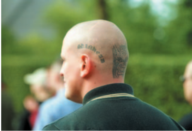
Plate 1.1 How easy is it for people to suppress their prejudice towards skinheads?