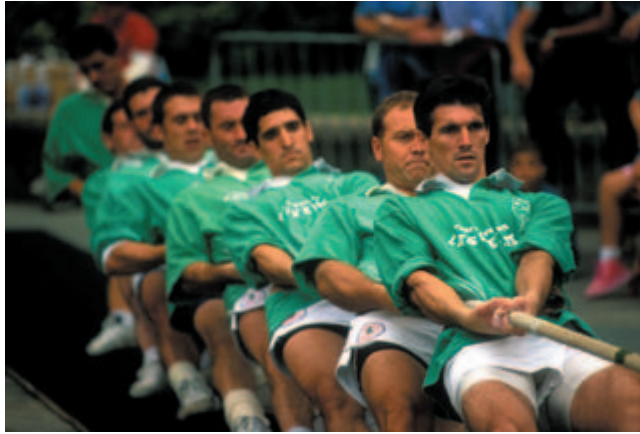
Plate 1.3 Do the men pull to their potential? If not, why not?