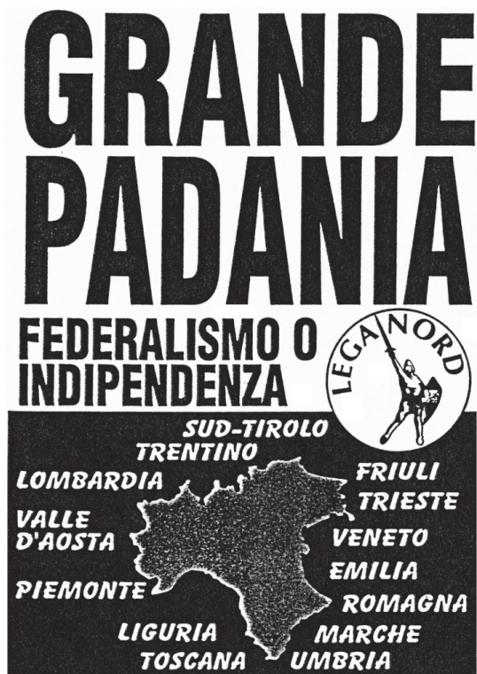
Figure 1 The Lega Nord's geographical representation of the boundaries of 'Padania', taken from the party's 1996 National election campaign

the Lega Nord maybe the first authentic post-modernist territorial political movement in its self-conscious manipulation of territorial imagery to create a sense of cultural/economic difference with an existing state of which it is part. (Agnew and Brusa 1999, 123)