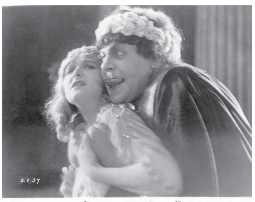
🗑 'QUO VADIS' A FIRST NATIONAL PICTURE 🕲

Plate 1.1 Nero attempts to rape Lygia. Source: 1925. Producer: Arturo Ambrosio, Unione cinematografica Italiana; Eastman House