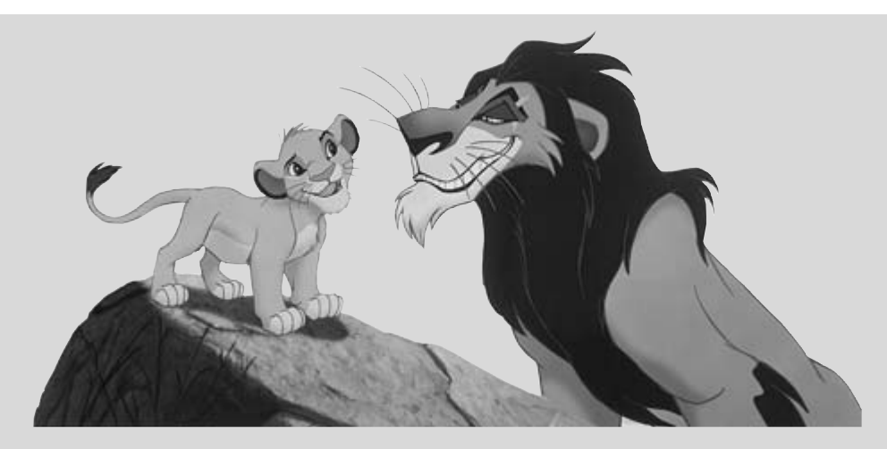
Uncle Scar preens with an arched eyebrow (a stereotypical signifier of male homosexuality) as he plots against Simba, the "true" and "rightful" ruler of the jungle, in Walt Disney's The Lion King (1994). The Lion King, copyright © 1993, The Walt Disney Co.

had erased all evidence of human African culture, and employed white musicians to write supposedly "African" music. (This is a good example of the dominant culture industry commodifying and incorporating African style while ignoring the politics of race and nation.) Furthermore, Simba and his love interest are both voiced by white actors. Disney did hire a few African American actors as character voices (including the assassinated patriarch), but some viewers felt that these characters came close to replicating derogatory racial stereotypes. For example, although the baboon character Rafiki (voiced by African American actor Robert Guillaume) holds a place of respect in the film as the community's mystic/religious leader, he frequently acts foolish and half-crazed, a variation on old stereotypes used to depict African Americans. Furthermore, two of the villain's dim-witted henchmen were also voiced by people of color (Whoopi Goldberg and Richard "Cheech" Marin), linking their minority status to both stupidity and anti-social actions.