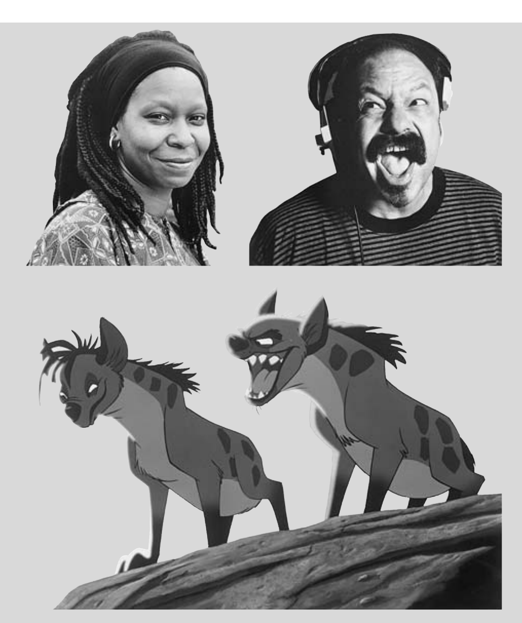
Scar's moronic and evil sidekicks are voiced by actors of color, Whoopi Goldberg and Cheech Marin. The Lion King, copyright © 1993, The Walt Disney Co.

focused on patriarchal privilege by dramatizing how a son inherits the right to rule over the land from his father. The film literally "nature"-alizes this ideology by making it seem as if this is how real-life animals behave, when in fact female lions play active roles in the social structure of actual prides, a detail the film minimizes (and which, by extension, minimizes the importance of females in