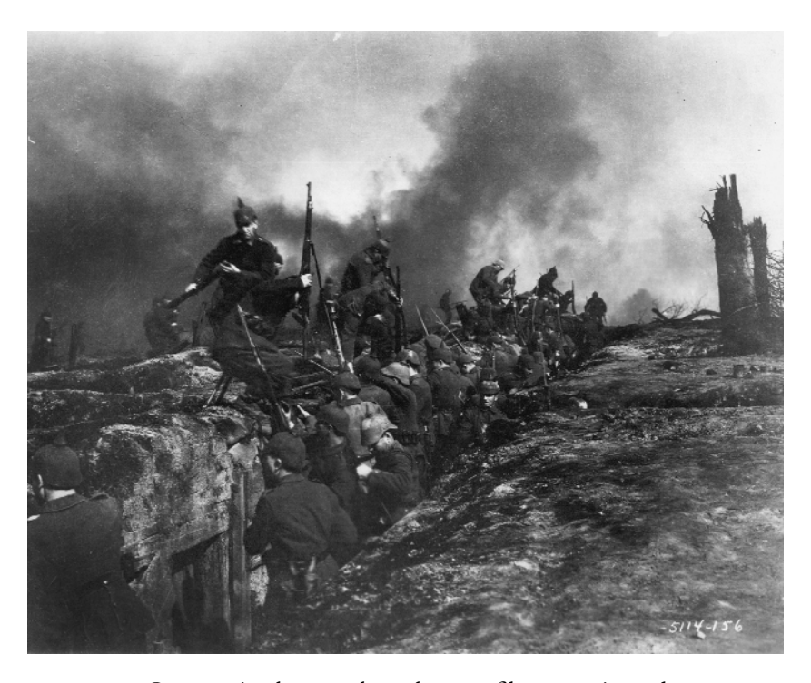
FIGURE 1.3 Carnage in the trenches: the war film as antiwar drama in Lewis Milestone's All Quiet on the Western Front (1930)

consequences of nationalism and patriotism, and stressed the dehumanizing effects of war, themes that would be taken up in later films such as Paths of Glory (1957), Born on the Fourth of July (1989), and Apocalypse Now (1979). The film is also unique for showing the effects of war from the perspective of a young German soldier, the first time Germans were treated sympathetically in Hollywood films made after the war. On the technical and artistic level, the film broke new ground with its use of elaborate, moving camera shots, created by using a mobile crane in the battle scenes – the most extensive use of moving camera in a sound film up to that time.