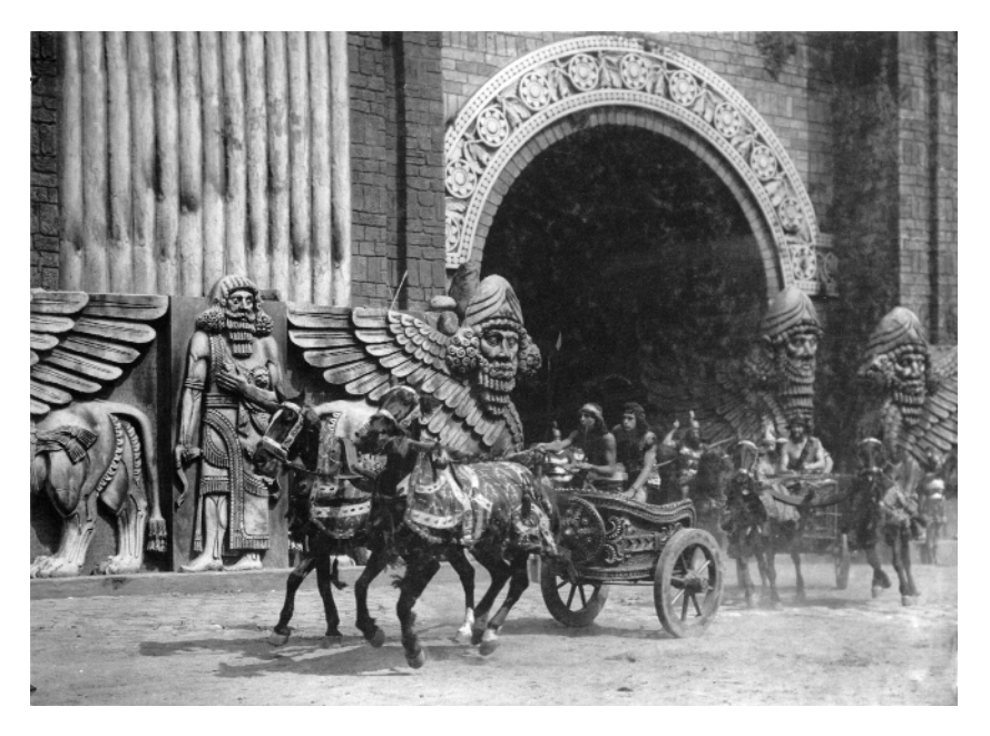
FIGURE 1.2 Outside the Babylon Gate, one of the magnificent sets of D. W. Griffith's Intolerance (1916)