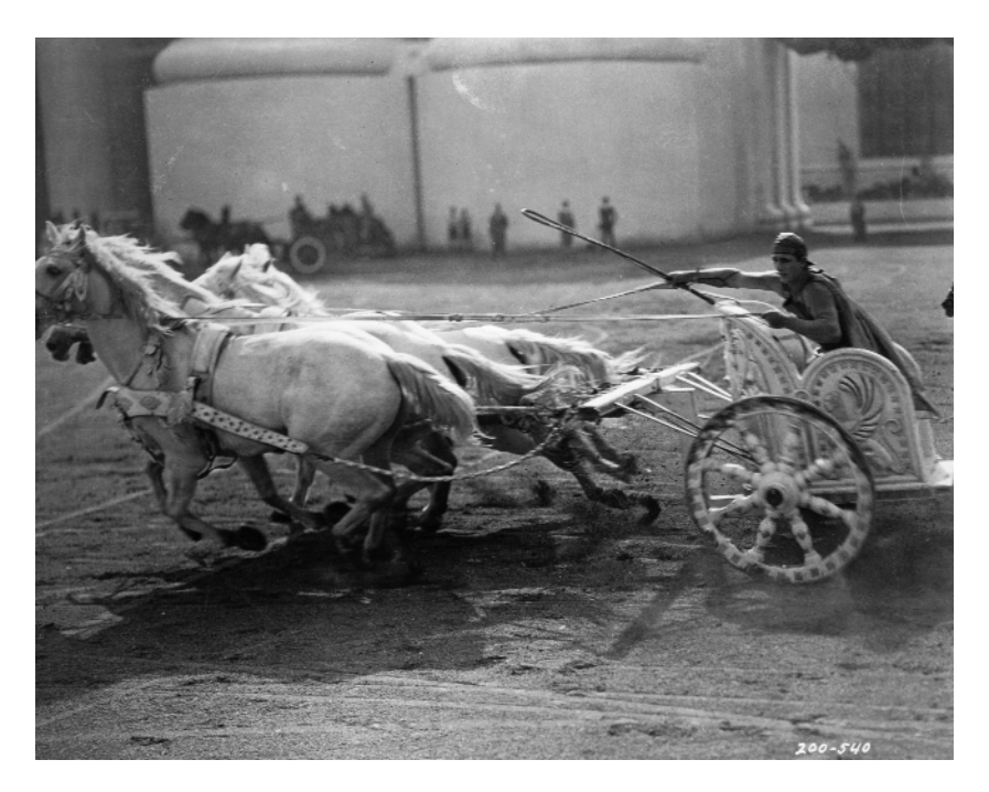
FIGURE 1.4 Judah Ben-Hur (Ramon Novarro) driving the chariot in a scene that defined the American epic on stage and on screen (1925)

exceptional treatments of the set pieces that made the play the most successful theatrical production in history, Ben-Hur was a magisterial accomplishment, consolidating the reputation of Hollywood as the primary producer of epic films.