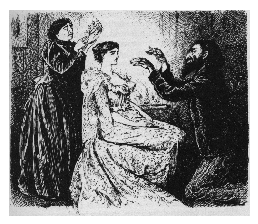
Figure 1 Svengali mesmerizing Trilby. Illustration from George du Maurier's 1894 novel, Trilby.

skill of a talented hypnotist. Early in the novel Svengali hypnotizes Trilby to relieve her headaches. She is grateful but is also disturbed by the strange power the man has over her and tries to avoid him as much as she can. When a series of personal misfortunes strike her, Svengali comes to her aid, taking advantage of her vulnerability. At that point the story of Trilby becomes a drama of psychological victimization.