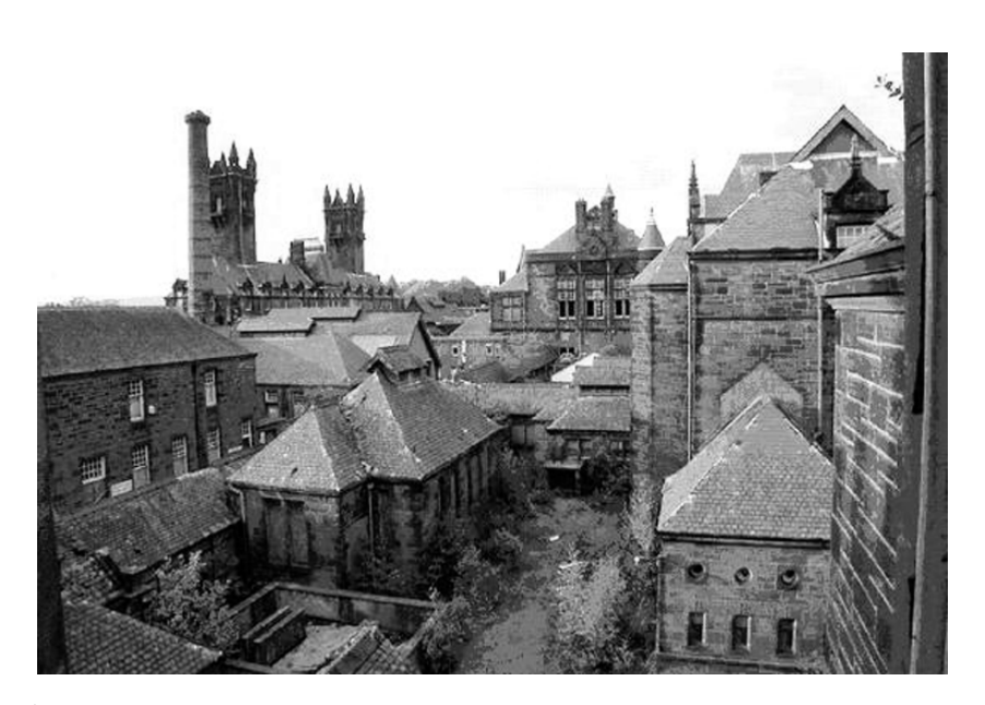
Figure 1.2 Gartloch Asylum, Glasgow.

More relevant is the fact that it gradually became apparent to the emerging state (and various lunacy commissions/ers) that the private and the charitable asylum solutions were not sufficient to cater for the large numbers of poor people starting to be identified as mad, perhaps as a result of increasing awareness of this (problematic) category of the lunatic, and perhaps as a