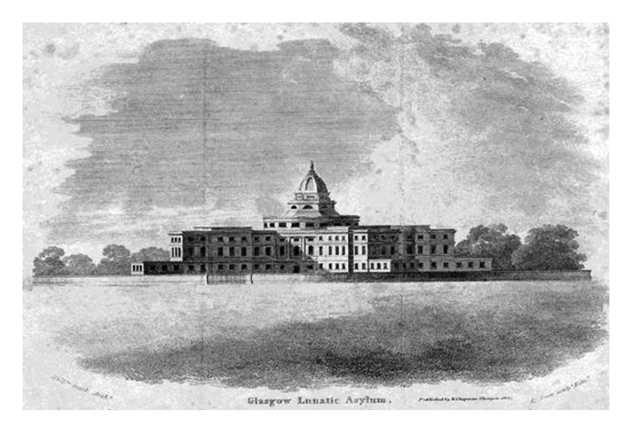
Figure 1.1 Glasgow Lunatic Asylum: sourced from Stark (1807), reproduced in Chapman (1812). Permission granted by the Archives and Special Collections Department of the Glasgow Mitchell Library.

The birth of the asylum in the late 1700s and early 1800s can be seen as another possible outworking of the 'great confinement' of the poor, but this is not to collapse these two processual 'events' onto one another, but to recognize them as related but also distinct processes. There are a myriad of other explanations and interpretations for the asylum impulse, including both medical and moral imperatives. Since the early 1600s there had been private 'madhouses' for the rich; profitable spaces where carers reflected on the nervous dispositions of their wealthy clients, contributing to some sense in which madness might be conceived of as a medical condition (Parry-Jones, 1972; Philo, 2004, ch. 5). Alongside this provision, and partly because of the need for a more mixed economy of care for non-elite clientele, charitable lunatic hospitals emerged from the early 1700s onwards and these were at first associated with general voluntary hospitals, also helping to ensure an emergent 'medicalization' of the mad (Philo, 2004, ch. 6). However, perhaps the most famous of these facilities in a British context was the York Retreat, the charitable rural asylum retreat in Yorkshire, first opened in 1796, and run by the Tukes, a Quaker family (Digby, 1985). This famous model for the moral management and treatment of the mad served