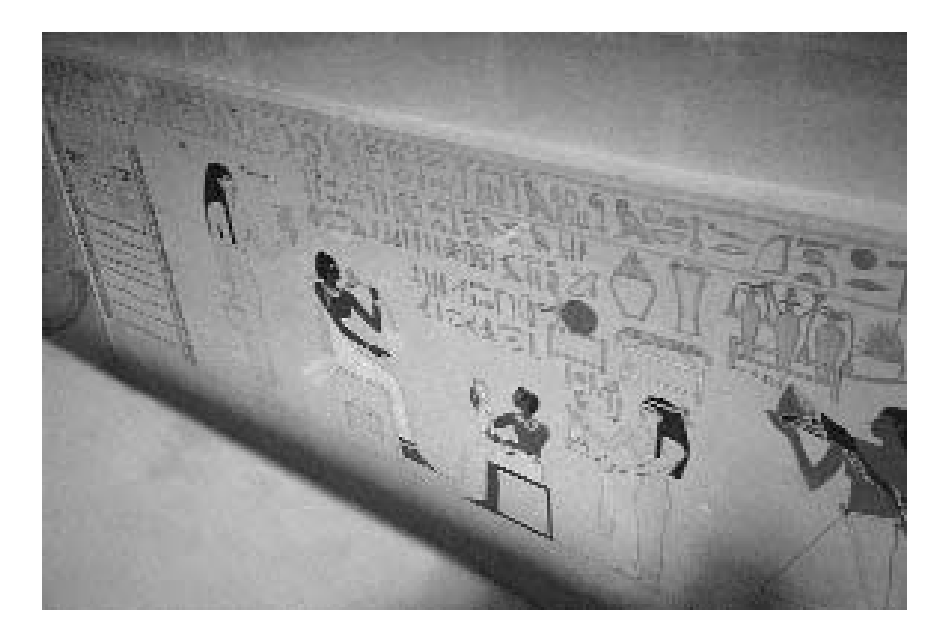
Figure 1.3 A royal audience, c. 1870 BC: the scribe of the divine book Intef recites a liturgy from a manuscript to his mistress, the princess Ashayet. A scene on the inner face of her sarcophagus (Cairo JdE 47267)

deeply problematic, especially since there is no surviving substantial metadiscourse about literature or performance outside of the poems themselves (see Parkinson 2002: 45-85). Literary texts did not feature in ancient visual representations: scenes of reading or performing are absent in the extensive body of elite tomb scenes showing the activities of the living, and Adolf Erman suggested that this was because such stories were "recited only to the common people in the street" (1927: xxix). This is unlikely to be true, partly because many lowly activities were represented in these scenes and partly because written literature belonged to an upper elite sphere. This absence of representations of literary texts contrasts with the moderately numerous depictions of administrative manuscripts being compiled or being presented to tomb-owners (e.g. Der Manuelian 1996b). Ritual lyrics and recitation are also sometimes attested in tomb scenes (e.g. Morenz 1996: 58–77), as is the presentation of liturgical documents (cf. Dominicus 1994: 80-8). One such scene on the sarcophagus of the 11th-Dynasty princess Ashayet from the Southern City shows a seated scribe of the divine book reading a liturgical text to her (Fischer 1996: pl. 14b; Morenz 1996: 71-4; Fig. 1.3). Likewise, musicians and singers could be represented, evoking the