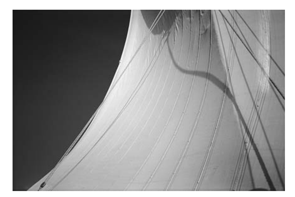
Figure 1.1 "Sitting under (modern) sail on a windy day." An ancient image transformed into physical experience in a felucca in the cataract landscape near Abu, modern Aswan

1956: 39 [106]; Goedicke 1970: 174) seem redundant, as the waters of the cataract swirl as they always have, beating against the prow and troubling the expanses between the boulders.