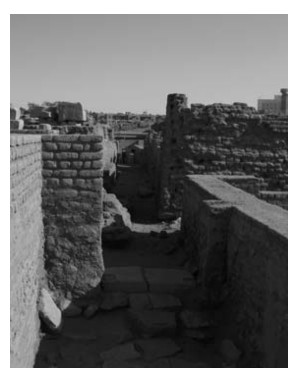
Figure 1.2 The houses and streets of Middle Kingdom Abu, with human scale: a view down an alley (from House 70) leading to the chapel of Heqaib with its modern roof.

archaeological practice involves a thinking ourselves into the past.<sup>4</sup> In particular, dirt archaeology can offer a density of detail about areas of lived experience, from which the contextually mobile manuscripts have often been abstracted. The settlement of ancient Abu is well documented, thanks to the excavations of the Swiss-German missions<sup>5</sup> and the work of historians such as Detlef Franke (1994). The site includes a chapel of a local saint, Heqaib, that was discovered in 1932 by villagers seeking fertilizer and was first excavated by Labib Habachi, a native of Aswan (1906–84: Habachi 1985). Around the chapel, houses of the late 12th Dynasty (Fig. 1.2) can still be viewed with their oven-rooms, courtyards, and divans, and their