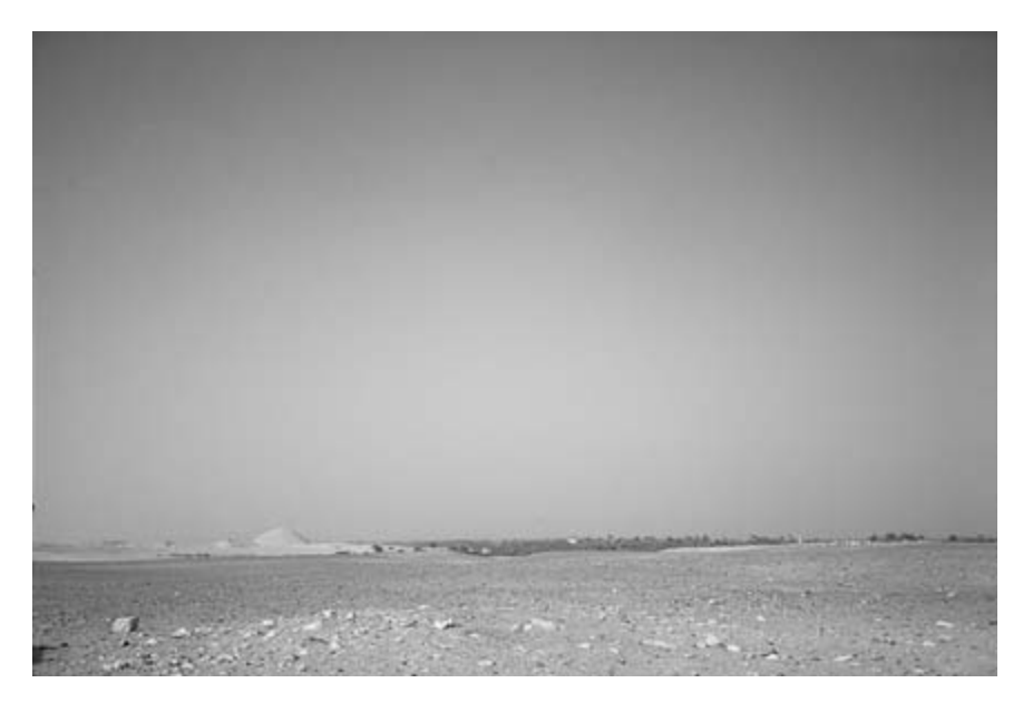
Figure 1.5 The desert landscape near modern el-Lisht, looking from the pyramid of Kheperkare Senwosret I toward the pyramid of his father Sehotepibre Amenemhat I. In the valley beyond is the probable site of the Residence of Itj-tawi

of el-Lisht may even derive from an abbreviated form of the ancient name, Itju (W. K. Simpson 1963b: 59 n. 29). But despite this enduring fame, we know nothing of the physical palace of the early 12th Dynasty that was the center of the Residence and that is so prominent a location in Sinuhe .