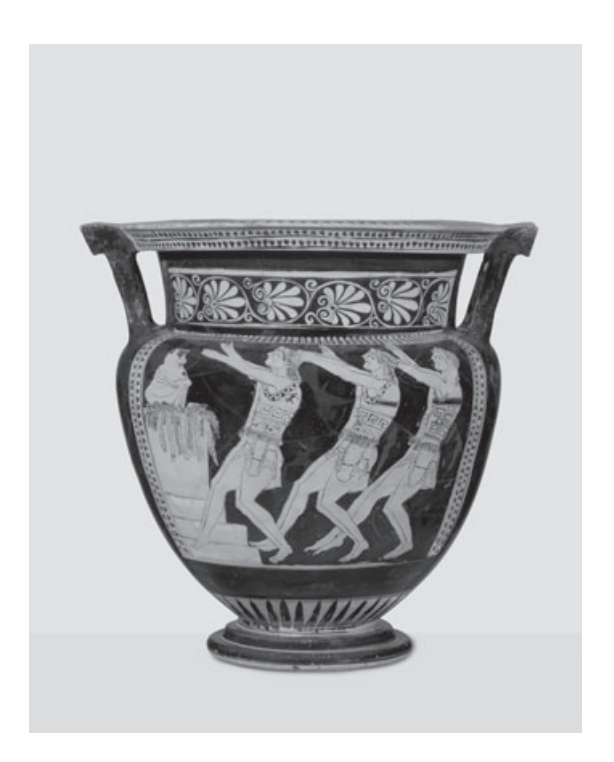
Figure 2. Attic red-figure column-krater with a chorus of youths raising a figure from a tomb. (Antikenmuseum Basel und Sammlung Ludwig, Inv. BS 415.)

Despite Aristotle's claims that the spectacle is the least important aspect of the tragedies, and that even hearing the story should elicit the tragic emotions of pity and fear, Greek tragedy was written to be performed. To state the most important points: it had a conventional, not realistic, aesthetic. There were at the most three actors, all men, who performed in masks; they were accompanied by a chorus of twelve to fifteen men who sang and danced, also masked (see Figure 2). The set had only the most basic markers of place. The audience, then, was