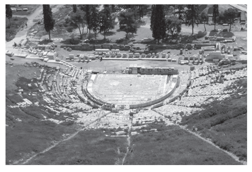
Figure 4. Theater of Dionysos

in the deme theater of Thorikos (Figure 6), others think it was circular, as it was in the later theater at Athens (Figure 5). Like the question of origins, this issue has ideological significance. For instance, if we emphasize the chorus and hypothesize a circular playing area, we can retain "the traditional idea of a democratic Athenian community gathered in a circle in order to contemplate itself in relation to the fictive world of the play" (Wiles 1997: 52). The circle theory sees corroboration in the notion of a round threshing floor, as well as from lines in the Iliad (18.590ff.); thus, it is related to assumptions about the connection between harvest and dance, between dance and chorus, between chorus and tragedy, as an evolved form. This way of thinking emphasizes the fact that the audience looks at one another, not on some individual leader; the shape of the auditorium is related to democracy, not tyranny. Other writers, however, disagree with one element or another of this correlation.