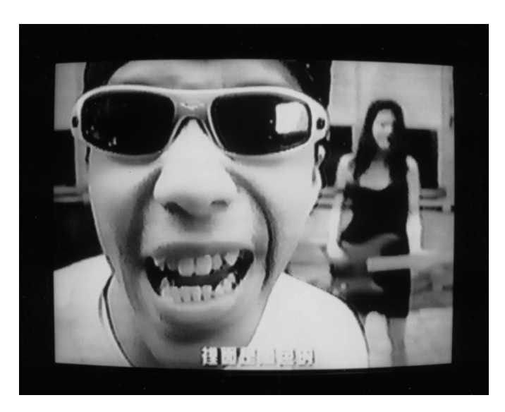
Photo 1.2 Do you speak MTV? Globalized media and popular culture like MTV Asia challenge traditional values in every corner of the world, including China (printed with permission of MTV)

and formats in the era of globalization. As British sociologist David Chaney points out, "traditionally, social institutions such as family and religion have been seen as the primary media of [cultural] continuity. More recently... the role of ensuring continuity has increasingly been taken over by... forms of communication and entertainment" (Chaney 1994: 58).