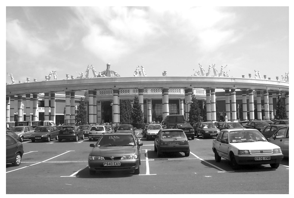
Figure 1.1 The Trafford Centre, Manchester.

locations on arterial roads, with access provided by 'comfortable driving' conditions (i.e. at a controlled junction and with a petrol filling station at the exit) (Hawking, 1992). The reasons for this are many. It has been noted that: