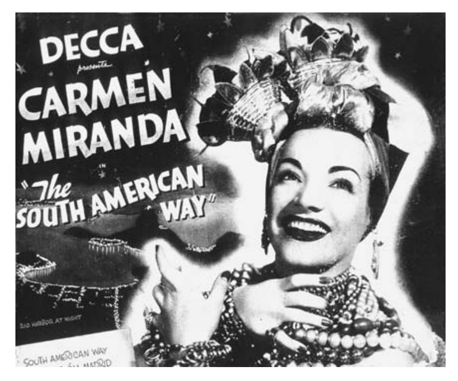
Figure 1.1 Carmen Miranda: The South American way.

... Hell-o A-mi-gos! I'm Chiquita Banana and I've come to say Bananas have to ripen in a certain way When they are fleck'd with brown and have a golden hue Bananas taste the best and are the best for you! [...] But bananas like the climate of the very very tropical equ