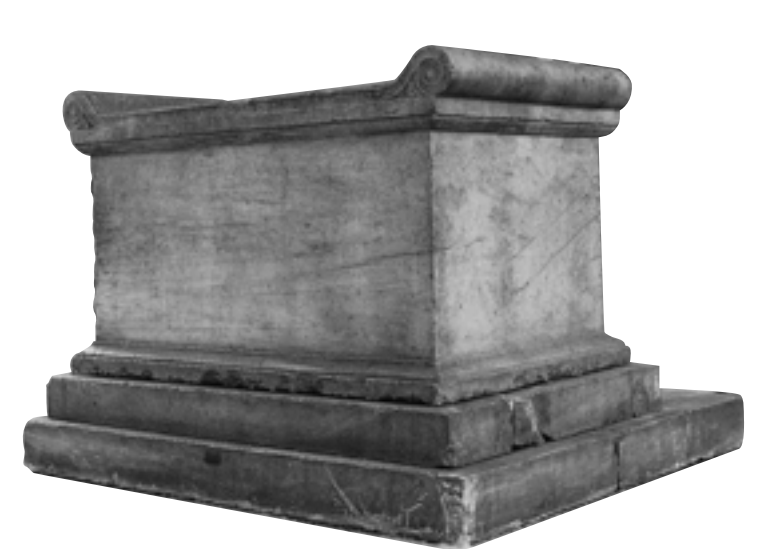
Figure I.3 A marble altar, dedicated by the Athenians to Aphrodite and the Charites in 194/3 B.C.E. It was discovered by the Agora in Athens and is now on display in the National Museum. Photograph courtesy of the National Museum, Athens, inv. no. 1495.