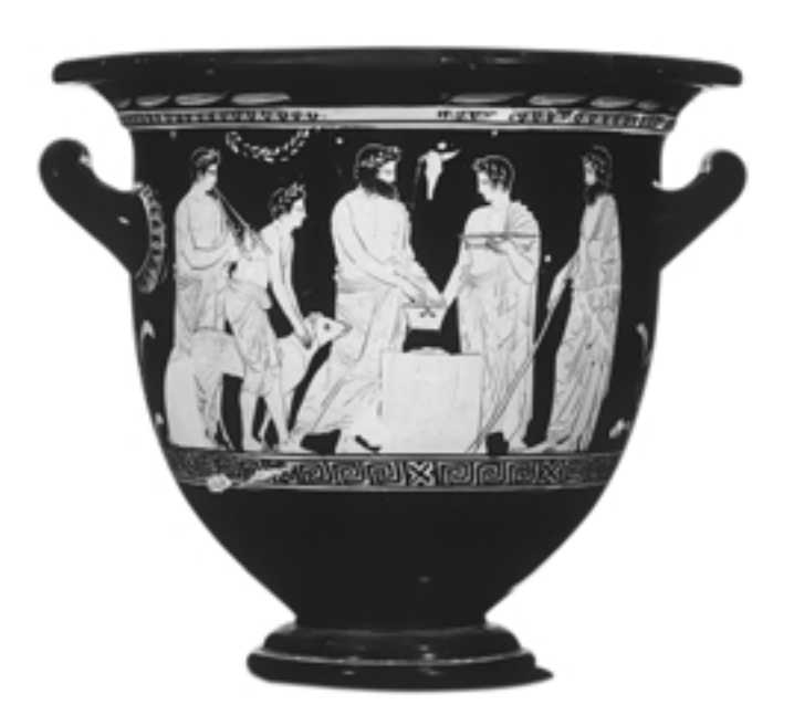
Figure I.6 An Athenian red-figure crater (mixing bowl for wine) from about 425 B.C.E., by the Cleophon painter or a member of his circle; 42.3 cm. high and 47 cm. in diameter. In the lower center stands the altar over which the bearded sacrificer washes his hands in a bowl held by a young man. In his left hand the young man holds a container for the sacrificial knife. The victim, a sheep, is depicted on the left. Note the double-flute player on the far left and the garlands worn by all. Courtesy of the Museum of Fine Arts, Boston, 95.25. Photograph © Museum of Fine Arts, Boston.