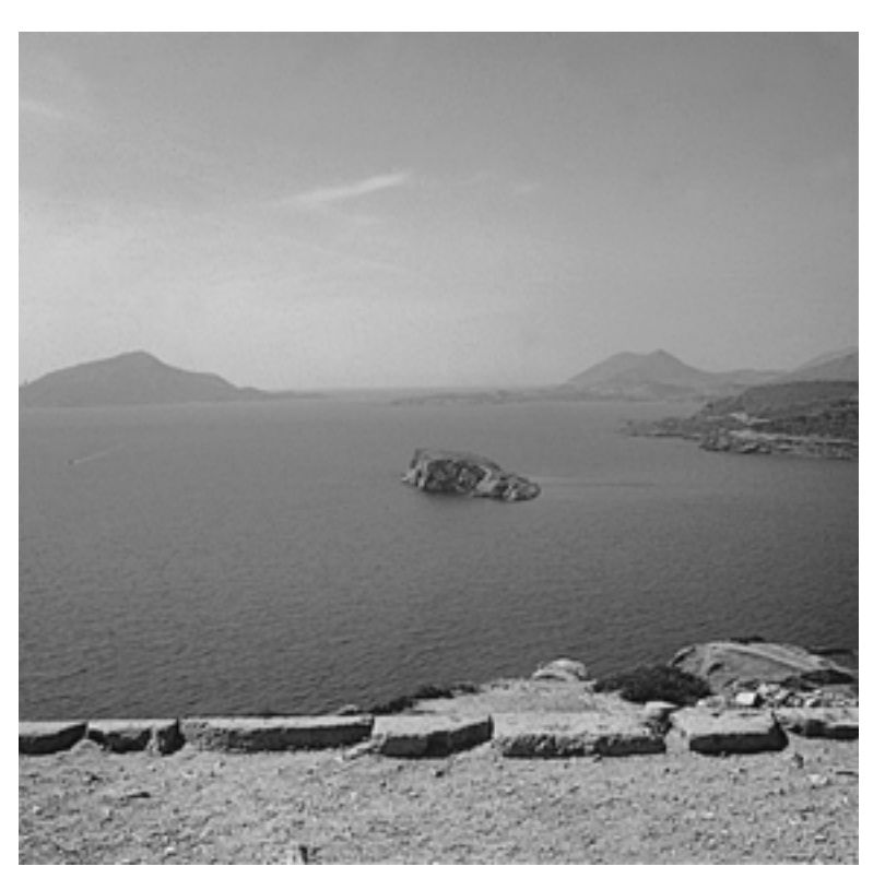
Figure I.2 View of the Aegean Sea from the cella of the Temple of Poseidon at Sunium.

role in locating Asclepius' sanctuary on the south slope of the Acropolis in 420/19. Places touched by the gods themselves, as by Zeus with his lightning or by Poseidon with his trident on the Athenian Acropolis, also became sacred. By contrast to these naturally numinous places many cult sites, especially in urban areas, seem to have been selected based on the deity's function. Athena, the armed patroness and protectress of Athens, had her major sanctuaries on the Acropolis, the city's fortified citadel. The cult sites of Zeus Boulaios (of the Council), Zeus Eleutherios (of Freedom), and Apollo Patroös (Ancestral) were clustered on the west side of the Agora (marketplace), in the Classical period the governmental and archival center of Athens. Similarly Hephaestus, the god of fire, shared a temple with Athena in an area of Athens that housed foundries and blacksmiths. The siting of these sanctuaries as well as of many in new cities founded as colonies suggests that often the Greeks were willing to locate sanctuaries, as we do churches, on the basis of land available and