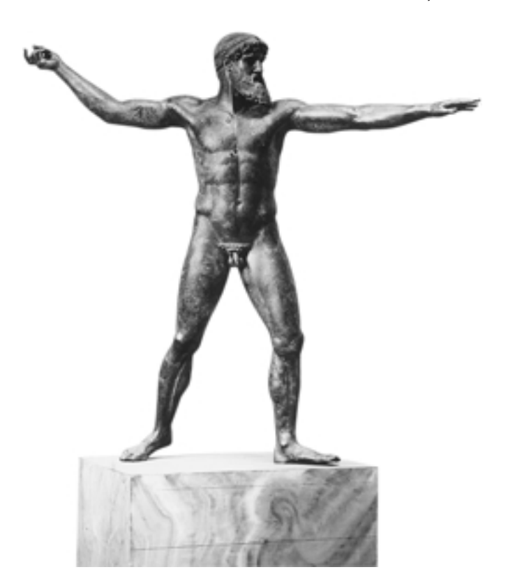
Figure I.7 Bronze statue of a god, 2.09 m. high, usually identified as Poseidon or Zeus, from about 460 B.C.E. It was recovered from the sea near Cape Artemisium off the east coast of Greece and is now in the National Museum, Athens. For a close view of the head, see Figure I.1. It is this statue we use as a model for the statue of Poseidon Soter in his sanctuary at Sunium.

We must plan where to place it and how to shelter it, and this introduces the most familiar but perhaps least common element of a Greek sanctuary, the temple. The temple is, in essence, a large rectangular room, oriented to the east, with a door on the short, eastern side. It may, but not necessarily, have a front porch, a back porch, and a detached colonnade supporting the superstructure of the roof. The Greek term for the whole building is naos , for the central interior room megaron , but for both we most commonly use Latin-based terms, for the building temple , for the inner room cella . The columns are usually fluted, the entablature above