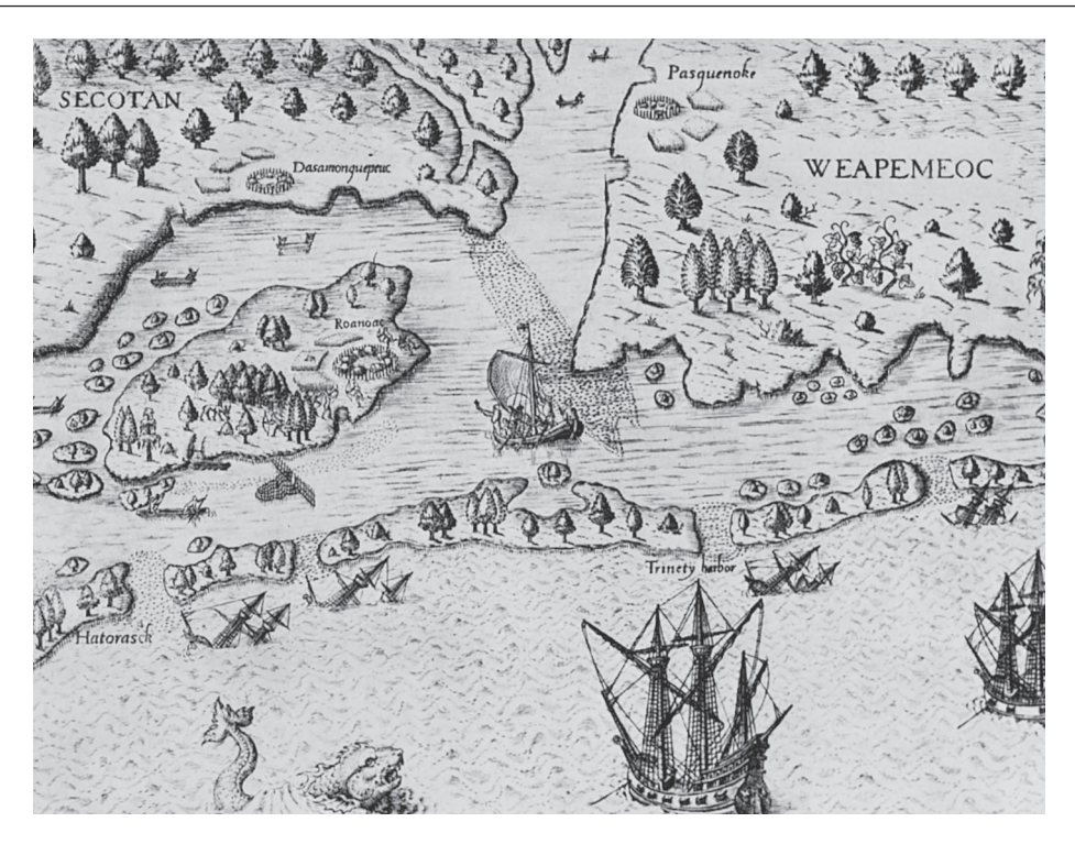
Plate 1 Roanoke and its vicinity 1585, by John White.

had been sown, nor habitable accommodation maintained. In this critical situation it was decided that White should return to England for additional help.