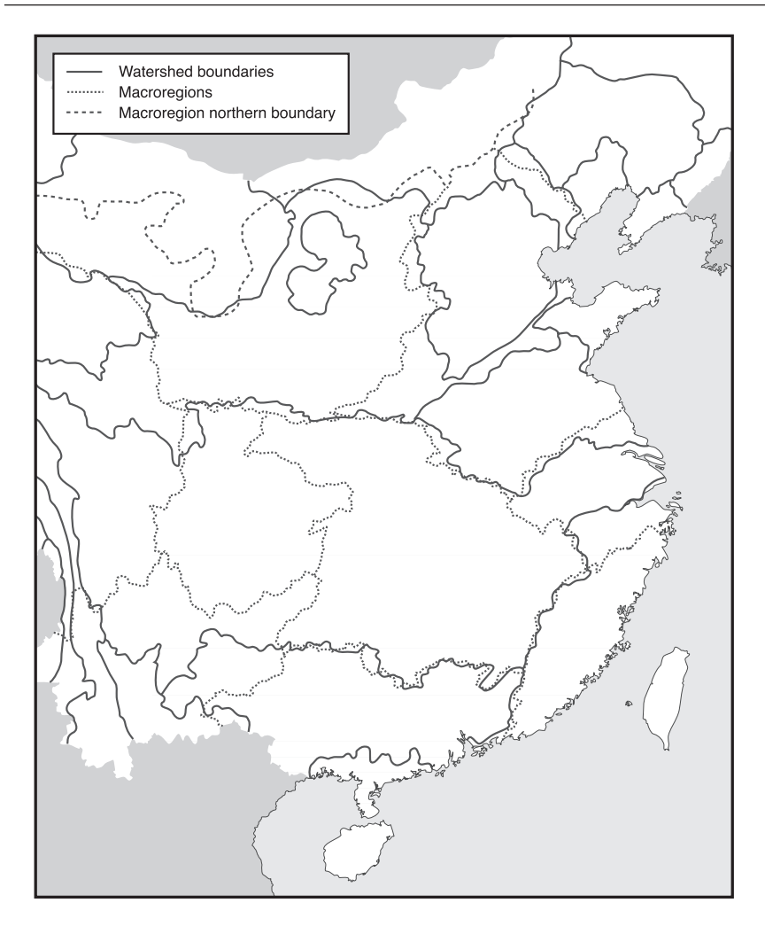
Map 1.2 Macroregions and natural watersheds. line work by Jane Sinclair.

pp. 8–9; Naquin and Rawski, 1987; Esherick and Rankin, 1990, pp. 17– 19; Spence, 1990, pp. 91–3; Dean, 1993, pp. 21–3; Leong, 1997, p. 19; Wigen, 1999, p. 1185). Continued reference to the macroregion model in the face of the decline of location theory in geography must reflect a lack of engagement between China area studies and advances in geography, and the area studies–disciplinary divide in the academy. Diverse approaches in regional analysis have characterized geography since the era of regional systems theory but have not appeared in China area stud-