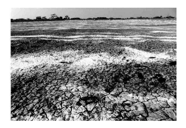
Fig. 19.5 Drying of pond bottoms until they crack and subsequent application of liming materials are important steps in pond preparation.

The rate of organic matter decomposition is greatest at a soil pH of 7.5–8.5 and, for ponds built on acidic soils, farmers add various lime products to improve