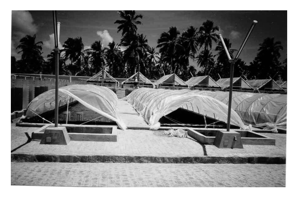
Fig. 19.8 Outdoor tanks for larval culture in a hatchery in Brazil.

Larval development from egg to PL is complex and involves three stages: nauplius, zoea and mysis.