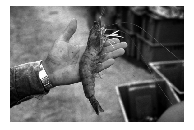
Fig. 19.1 The western or Pacific blue shrimp ( Litopenaeus stylirostris ).

commercially farmed species, two account for probably 90–95% of global production: