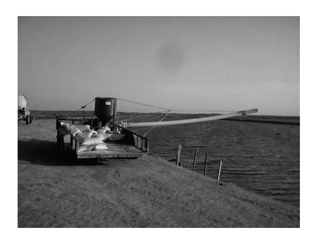
Fig. 19.10 A feed blower used to feed shrimp in ponds on a farm in Mexico.

Formulated feeds can be applied in a variety of ways to shrimp production systems (section 9.11.2). Feeds may be distributed manually in large ponds from boats or mechanically using blowers mounted on vehicles and boats (Fig. 19.10). Even crop-dusting aeroplanes have been used to distribute feed to very large ponds. In small ponds, tanks and raceways, automatic feeders with timing mechanisms can be used (section 9.11.2). At many farms in several countries, all feed is applied exclusively using feeding trays. Broadcasting feed from paddle- or motorboats is typical at many farms in Latin America. The use of feed blowers is not widespread yet, but could gain popularity in coming years because of their efficiency.