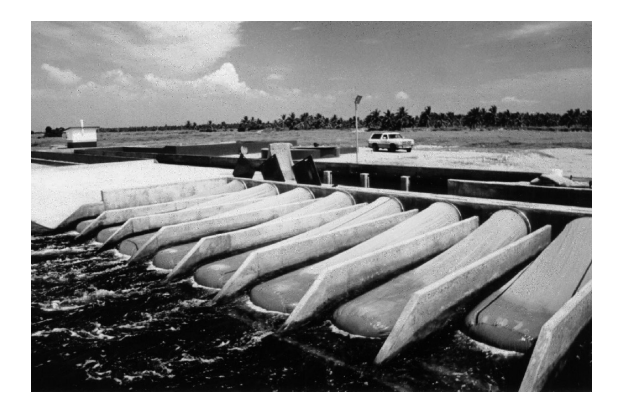
Fig. 19.6 A battery of bag nets used to filter the inflowing water at a shrimp farm in north-west Mexico.

significantly to stabilising and maintaining adequate water quality in shrimp ponds. This happens through several mechanisms (Cook & Clifford, 1998):