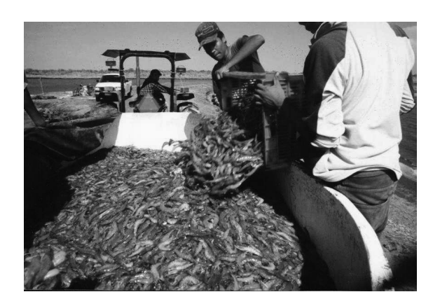
Fig. 19.9 Harvesting procedures are critical for the best-quality product that commands the best price.

texture (representative of the stage in the moulting cycle) of shrimp to be harvested is monitored by daily collection of a sample (100–300 animals/pond) to determine the percentage that are moulting. The particular requirements of the processing plant and the intended market determine what percentages of hard, soft and semi-hard (post-moulting) shrimp, as determined during pre-harvest sampling, are acceptable to proceed with a planned harvest. For example, for shrimp to be marketed whole, typically less than 5-8% of the animals sampled should be soft, and less than 15-20% should be semi-hard. Some farmers also stop feeding a few days before the harvest, but this is a decision that really depends on each pond, its biomass and its overall condition (Clifford, 1997).