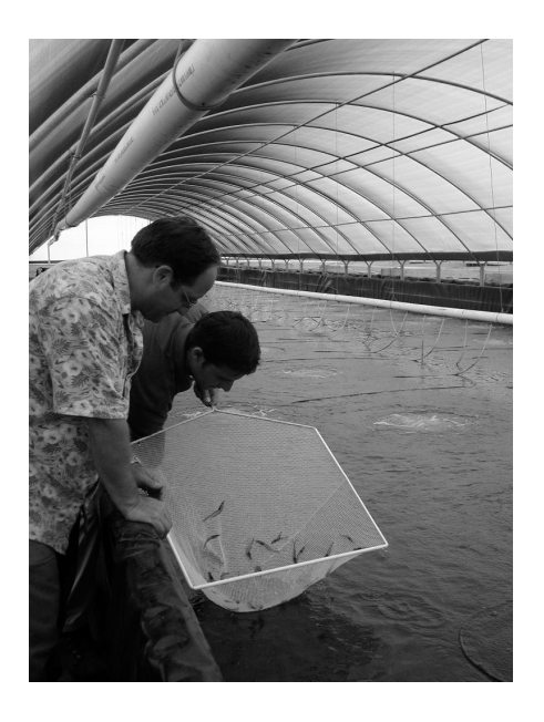
Fig. 19.11 An intensive nursery system culturing shrimp seedstock before transfer to ponds.

A two-stage grow-out system using a nursery phase as a quarantine area increases biosecurity. Indoor nursery systems increase turnover (number of grow-out production cycles) by reducing culture time to market size in grow-out ponds. Therefore, the grow-out pond is being used more efficiently as a biological system, and with greater capital and operating efficiency. A nursery system also provides improved accuracy to estimate the juvenile population before actual stocking in grow-out ponds. Thus, stocking juveniles allows for a more accurate estimate of the initial population and biomass, and improving feeding rate estimates when formulated feed becomes up to 60% of the production cost. Indoor, intensive nursery systems can further broaden the effective temperature, stocking