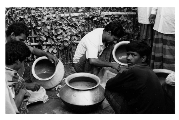
Fig. 19.3 Sieving wild-caught juvenile shrimp to sell for stocking extensive shrimp farms (Chalna, Bangladesh) (photograph by Professor Clem Tisdell).

In all cases, these shrimp feed on natural phytoand zooplankton, small plants and animals living in or on the pond substrate, and particulate organic matter suspended in the water or lying on the bottom. This natural production may be promoted with applications of organic or chemical fertiliser. It is extensive aquaculture, as defined in Chapter 2 (section 2.3.3), e.g. the cultured shrimp are essentially part of a natural ecosystem that provides their nutritive and other requirements. Construction and operating costs are typically low, with the latter ~US$1–3/ kg live shrimp, and production rarely surpasses