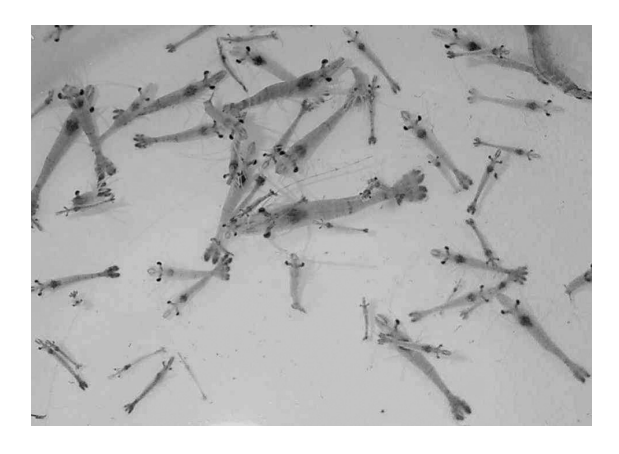
Fig. 19.12 Genetically based variation in size among sibling Penaeus monodon postlarvae.

while reducing environmental concerns. Reducing the cost of feeds is an aspect critical to further expanding the industry and improving its competitiveness relative to other protein sources, such as beef, pork and poultry. Low-pollution or 'environmentally friendly' feeds must be developed to reduce the environmental impacts of shrimp feeds. Currently, emphasis is on 'least cost' feed formulations for minimising feed cost while optimising aquaculture production. In the future, emphasis will also be on 'least polluting' feed formulations for minimising environmental impacts with the greatest compatible aquaculture production.