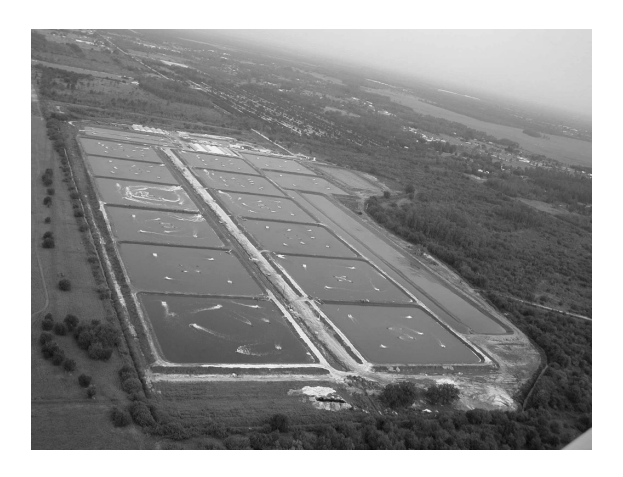
Fig. 19.4 The Labelle facility owned by OceanBoy Farms, Florida, shows recirculation and reduced water exchange technologies on a commercial scale. The treatment raceway (long and narrow on the right) is where suspended solids are removed and water is treated before re-use in lined and highly aerated ponds (photograph by OceanBoy Farms).

At the upper end of the continuum, systems with very high stocking densities (Table 19.2) include the highest level of environmental control, to the point of some being located indoors in greenhouses