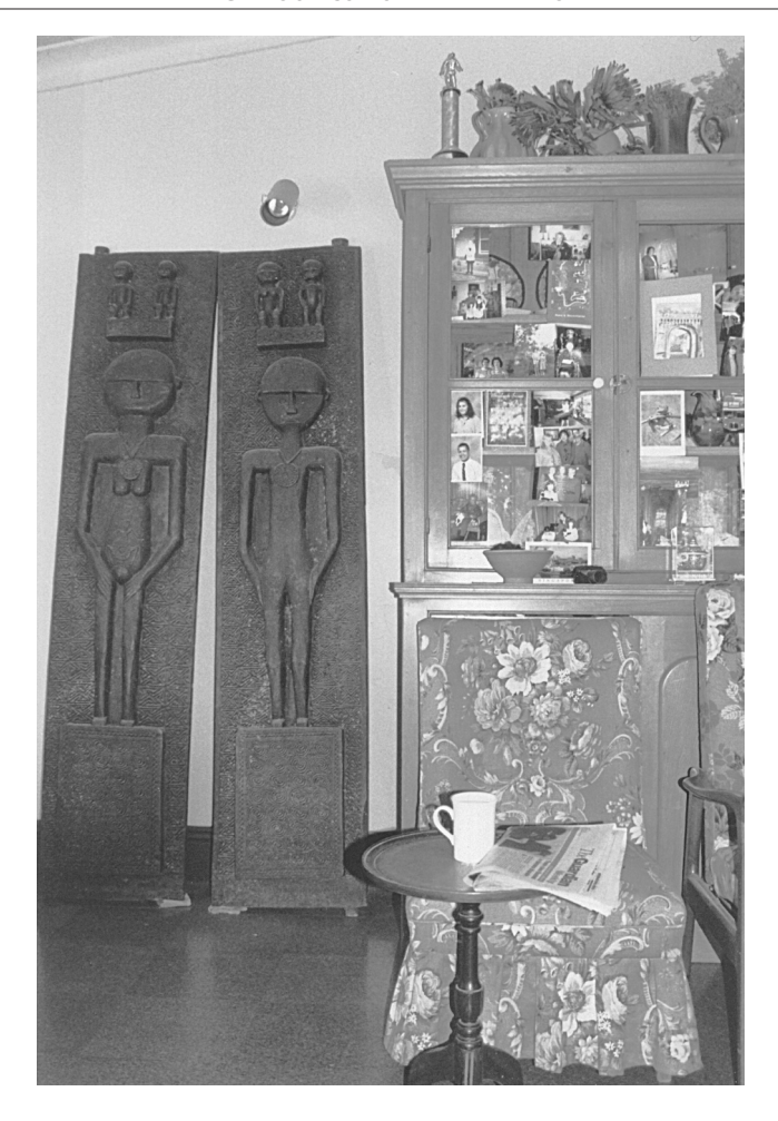
Figure 1.5 Doors from a ceremonial house in Tutulala, East Timor, adorning an Australian living room

ignores the ways in which apparent homogeneity and conformity are manufactured through subtle mechanisms of hegemony which define non-dominant cultural practices as deviant and marginal. It gives no sense of the ways in which "culture" is resisted and contested in any social unit. This is reinforced by the definition of "culture" as a discrete component of the social, separate from the economic and political dimensions of social life, as if ways of living, belief systems, rituals, and symbols are quarantined from the arenas of production and power. The Islamic revolution in Iran in 1979 is only one example showing the interconnectedness of culture, economics, and politics to which many Western observers had been blind (Allen 1992). As Tim Allen (1992: 333, 337) points out, Middle East expert Fred Halliday, in a book written on the eve of the revolution, "ends up deflecting attention away from religion as a key