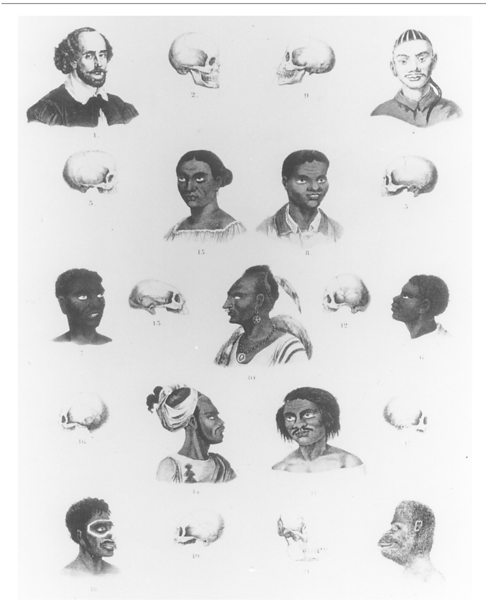
Figure 1.1 A hierarchy of races. Profiles and skulls of various "races" showing facial angles, from a European (top left) through various peoples to "savage" African towards an ape (1850)

in the ability to define what was considered "cultured." Certain human activities were designated as "cultured" – the arts and scholarship – while other activities such as manual labor, trade, and manufacturing were seen as uncultured. Increasingly, "culture" also included particular forms of social conduct, lifestyle, manners, and speech.