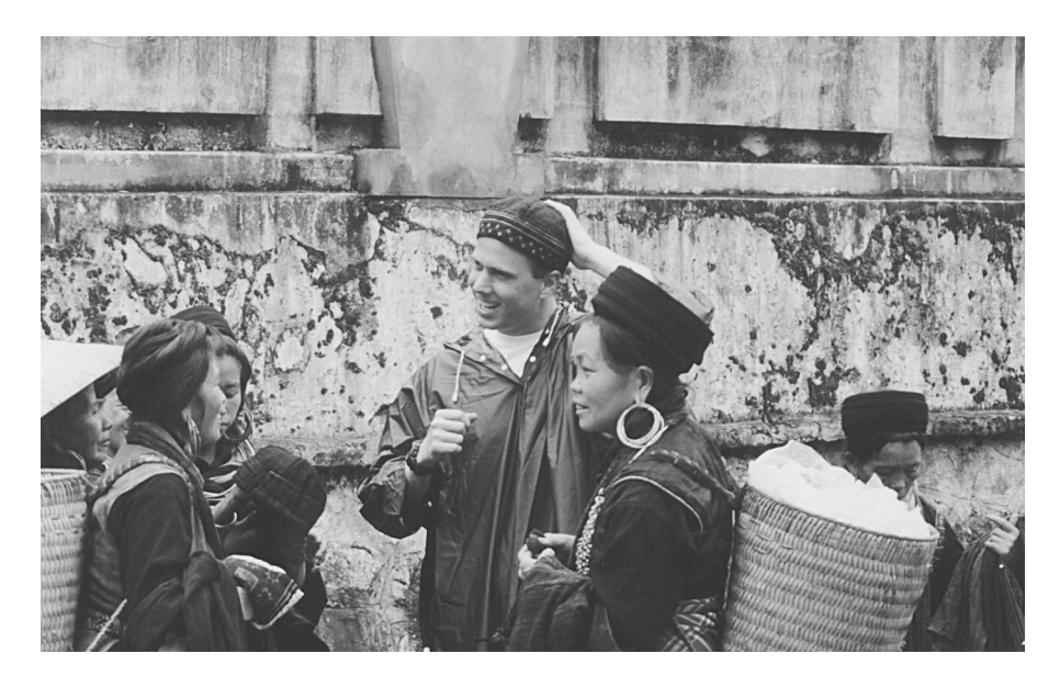
Figure 1.4 A tourist exchange in Sapa, Lao Cai Province in northwest Vietnam

Emphasizing culture as an integrative mechanism shared by all fails to acknowledge the power dimensions of cultural cohesion and uniformity. It