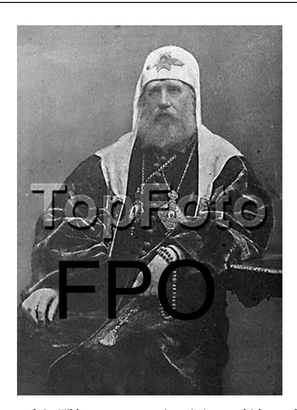
Figure 2 Image of St Tikhon, an energetic missionary bishop who came from America to be the first patriarch of Moscow after the restoration of the Russian patriarchate in the early decades of the twentieth century. Unfortunately the end of the heavy tsarist oversight of Russian church affairs was soon followed by the long nightmare of communist oppression, and Tikhon himself suffered much at the hands of Lenin and Stalin. It is widely suspected that his alleged natural death may have been one of the many 'secret murders' ordered by Stalin. The decades of state persecution and suppression following Tikhon's death caused much disruption in the national and international organization of Russian Orthodoxy.

and isolated Tikhon. In 1922 he was imprisoned in a monastery while moves were made to initiate the systematic breaking up of the ecclesiastical organization. The government launched its massive programme of confiscating church goods (icons and chalices and so on) under the heading of 'relief for the poor', the victims of the state-induced famine of 1921–2. Simultaneously it sponsored the formation of the 'Higher Church Administration' (HCA) which, using pro-communist clergy, declared that Tikhon had resigned his office and thenceforth the patriarchate was abolished, leaving the HCA as the supreme governing body of the Russian Church. Agathangel, the archbishop of Yaroslavl, who had been nominated by Tikhon as one of those who might lead the church if he himself was liquidated by the communists, immediately denounced the HCA and was exiled to Siberia. Metropolitan Benjamin of Petrograd