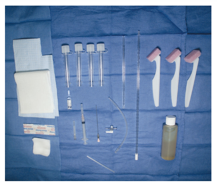
31-1 Standard commercial lumbar puncture kit.