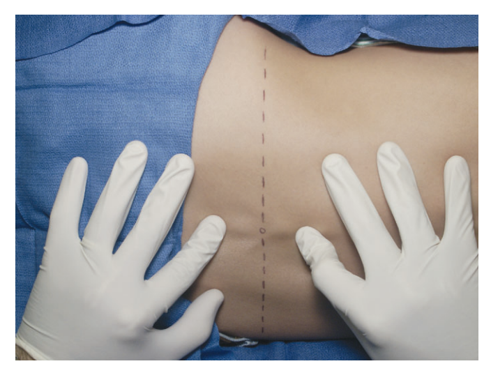
31-3 Lumbar puncture landmarks.