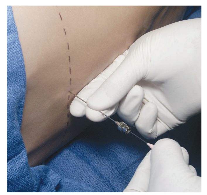
31-5 Removal of stylus.