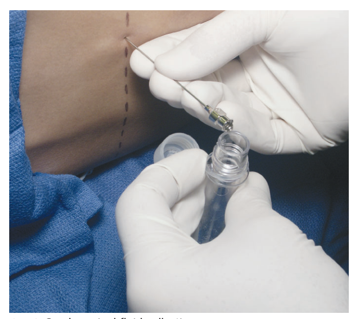
31-6 Cerebrospinal fluid collection.