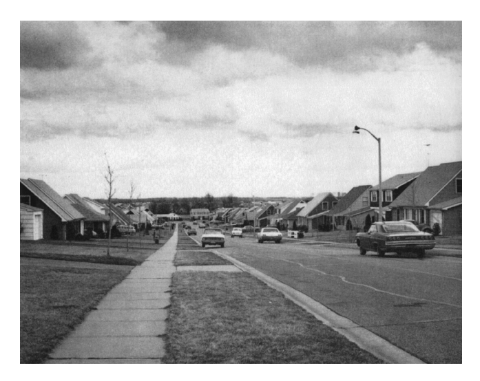
Figure 18.3 The US suburb of Levittown (Gans 1967, frontispiece)