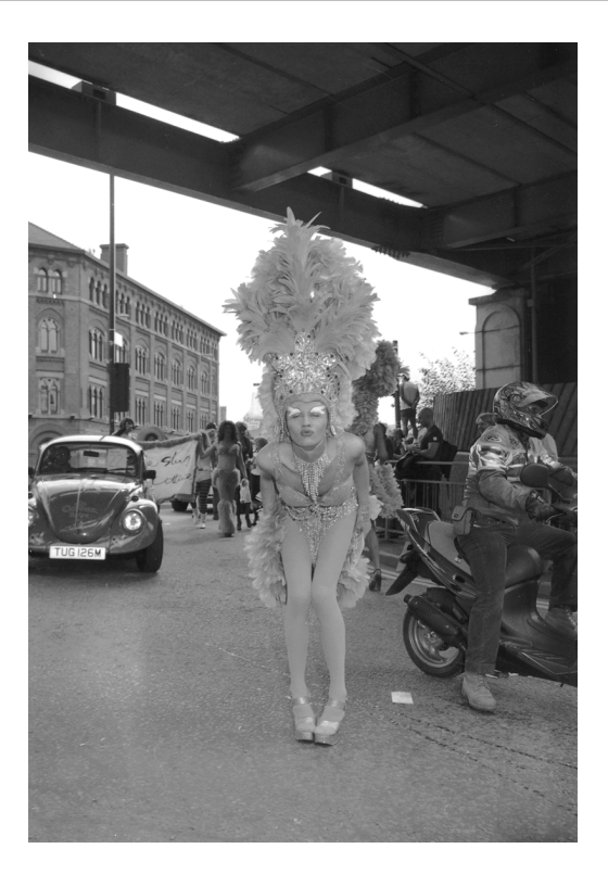
Figure 18.1 Gayfest, Manchester, UK, 2001

story, King Solomon's Mines (1885), shows a map that led the book's male heroes to some treasure. It portrays the story's African setting as the body of a woman. The map raises questions about how, why, and with what effect textual and other intangible geographies have been sexualized. The final image appears to depict an 'innocently' asexual place: an area of 1950s suburban housing in the United States. Yet this, perhaps more than anywhere, was constructed around expectations about sexual behavior. It would be impossible to understand Levittown without understanding that the people who lived there were expected to form heterosexual relationships, the women to have babies and raise children.