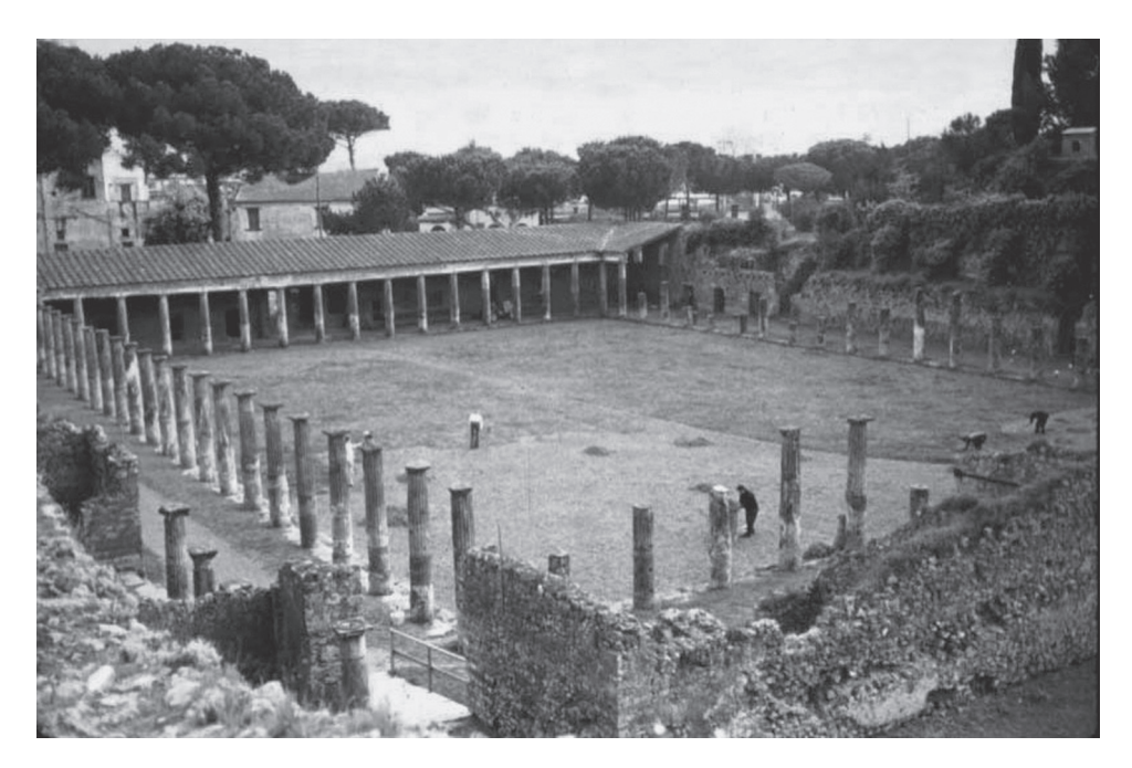
Figure 4.2 Pompeii, barracks of gladiators

"small ease" chambers, a person placed in this cell could neither stand nor stretch out fully inside. Graffiti recovered from the barracks were written by and about the gladiators, giving us glimpses into their lives.