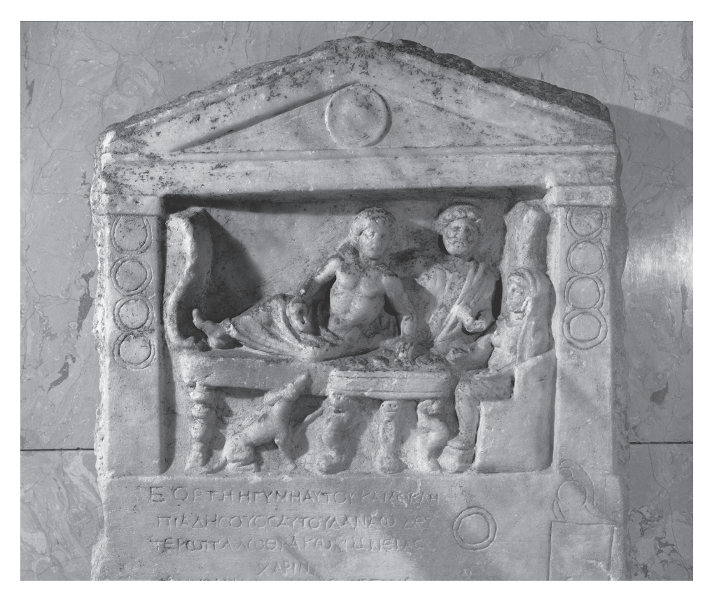
Figure 4.3 Tomb monument of Danaos.

Three tombstones from Gaul were built by the wives of the gladiatorial deceased. One notes that the money used was hers, which likely indicates she was a free woman of substance, even though her name does not survive.