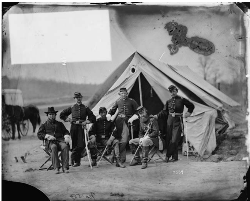
Photo 1. Six officers of the 17th New York Battery, Gettysburg, June 1863

wounded and the dead – the aftermath of battle. These photographs, although subdued by today’s standards of graphic images, “had a profound effect on viewers used to artistic depictions of wartime heroics. . . . The absence of uplifting tone in camera documentations was especially shocking because the images were unhesitatingly accepted as real and truthful” (Rosenblum, 1984, p. 182).