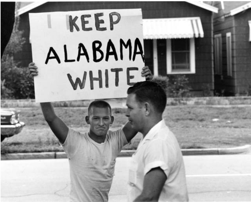
Photo 4. A protester against integration in Birmingham; Alabama; 1963.