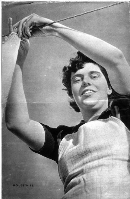
Figure 1.1. Steelworker and Housewife. Front and back cover of Something Done: British Achievement 1945-47