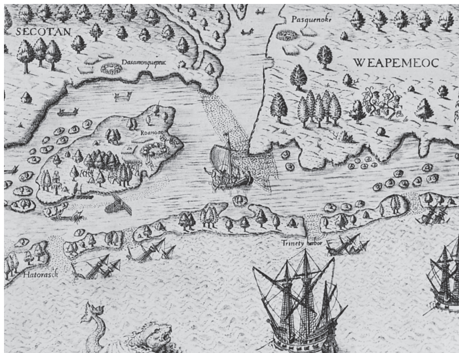
Plate 1 Roanoke and its vicinity 1585, by John White.

had been sown, nor habitable accommodation maintained. In this critical situation it was decided that White should return to England for additional help.