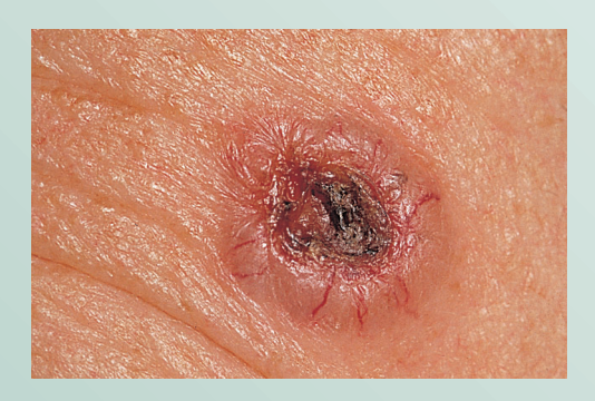
Fig. B Classical crateriform basal cell carcinoma. Ulcerating nodule.