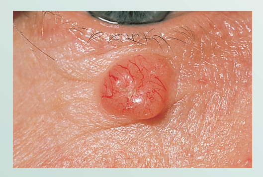
Fig. A Basal cell carcinoma below the right eye. Nodule.

Frequent central necrosis with crusting or ulceration More rarely, cystic or pigmented lesions