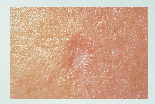
Fig. D Morphoeic basal cell carcinoma on the face. Irregular plaque.