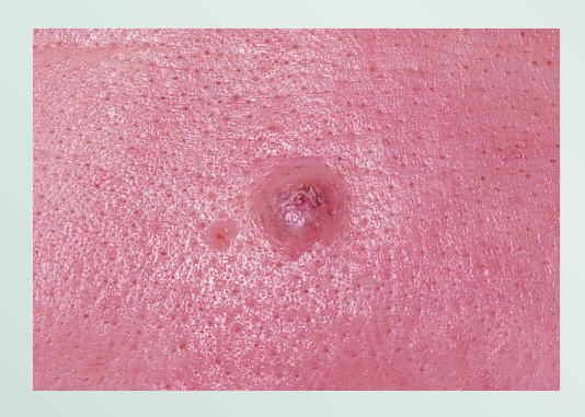
Fig. E Pigmented basal cell carcinoma.

Fig. D Morphoeic basal cell carcinoma on the face. Irregular plaque.