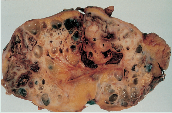
Fig. A A polycystic kidney. There are multiple cysts of different sizes, some filled with blood.